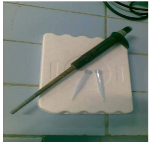
Ket: Mikropipet dan tips