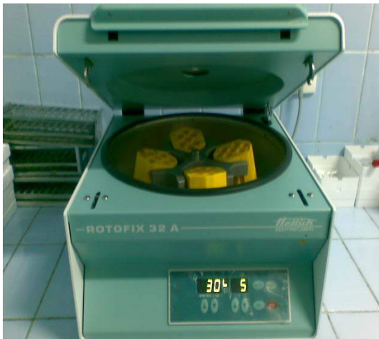
Ket : Sentrifuge