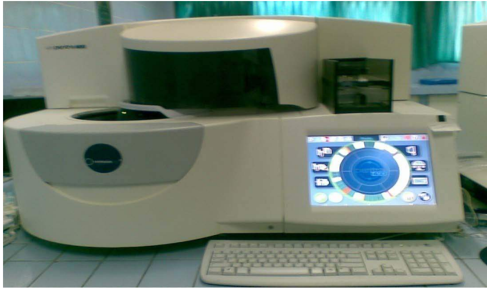
Ket : ABX PENTRA 400 Untuk Pemeriksaan Kreatinin Serum