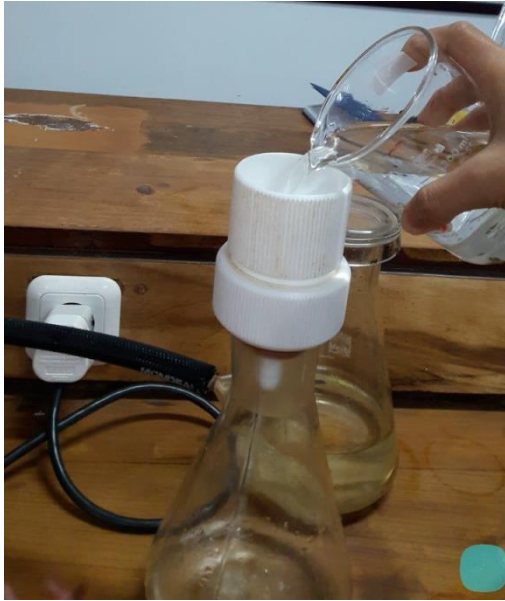
Gambar 18. Sampel disaring menggunakan kertas saring whatmann dibawah vacum pump