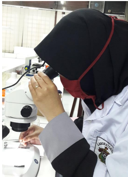
Gambar 20. Pengamatan menggunakan mikroskop