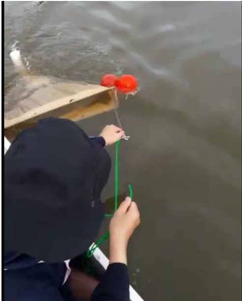
Gambar 14. Pengambilan sampel air