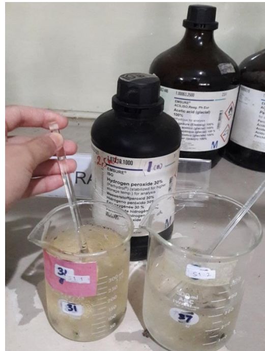
Gambar 17. Sampel yang telah diberi H_2O_2 di diamkan selama 24 jam