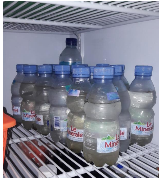
Gambar 15. Penyimpanan sampel di dalam freezer (suhu 4°)