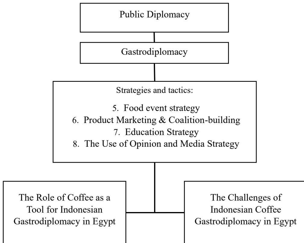
Picture 1 Conceptual Framework Thought Flow