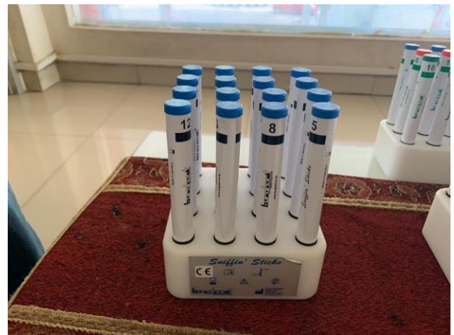
Alat Pemeriksaan Sniffing Sticks Test