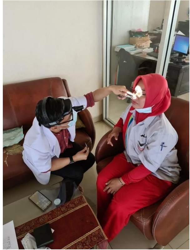
Pemeriksaan Fisik Pekerja SPBU