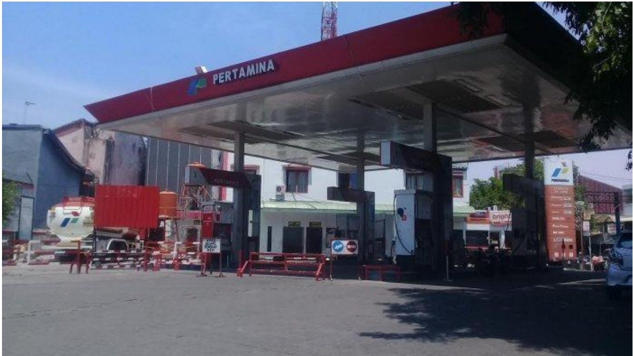
SPBU jl. Bawakaraeng, Makassar