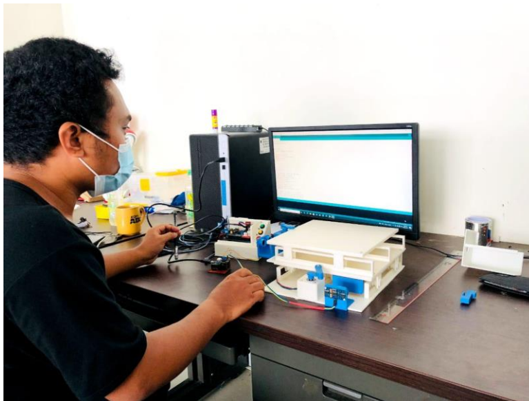
b. proses pengambilan data