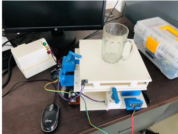
c. pengujian shake table 1