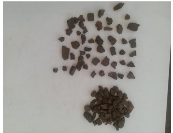
Figure 3. Nickel Slag (10-20)