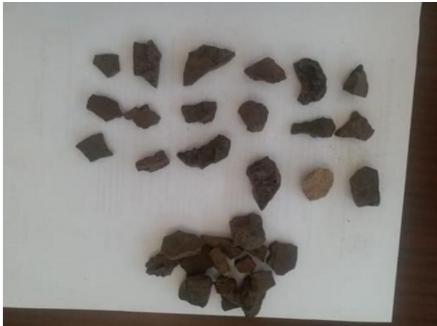
Figure 2. Nickel Slag (5-10)