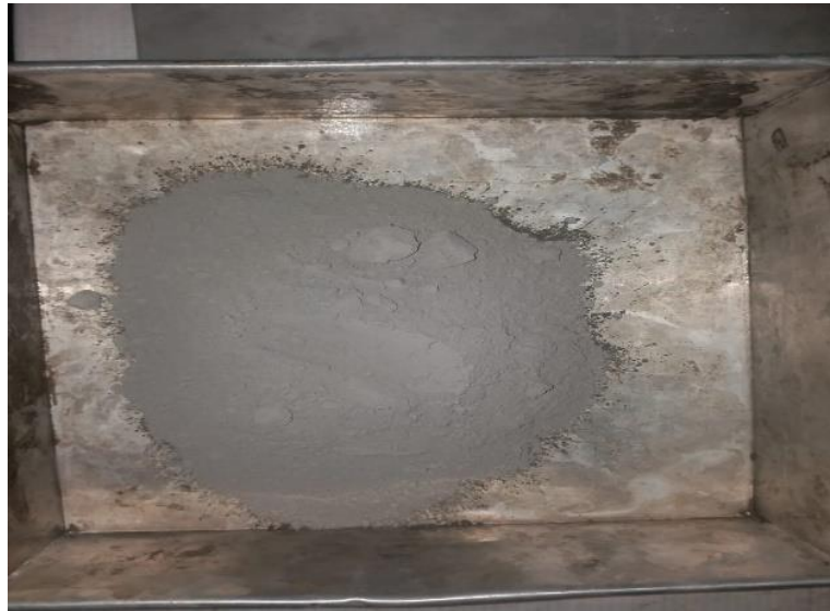
Figure 1. Portland cement