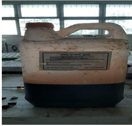
Figure 4. Additive