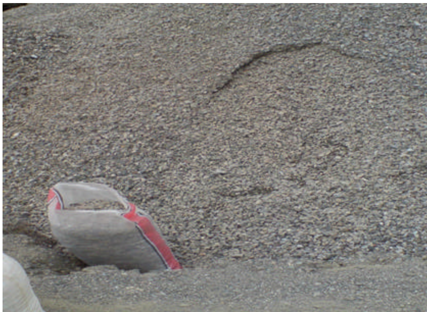
Gambar D4. Pengambilan agregat kasar