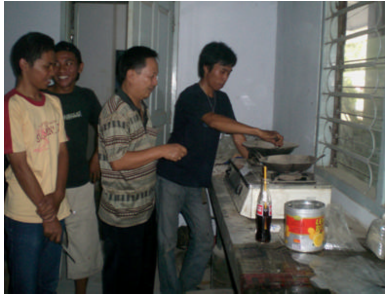
Gambar D9. Pemanasan Agregat