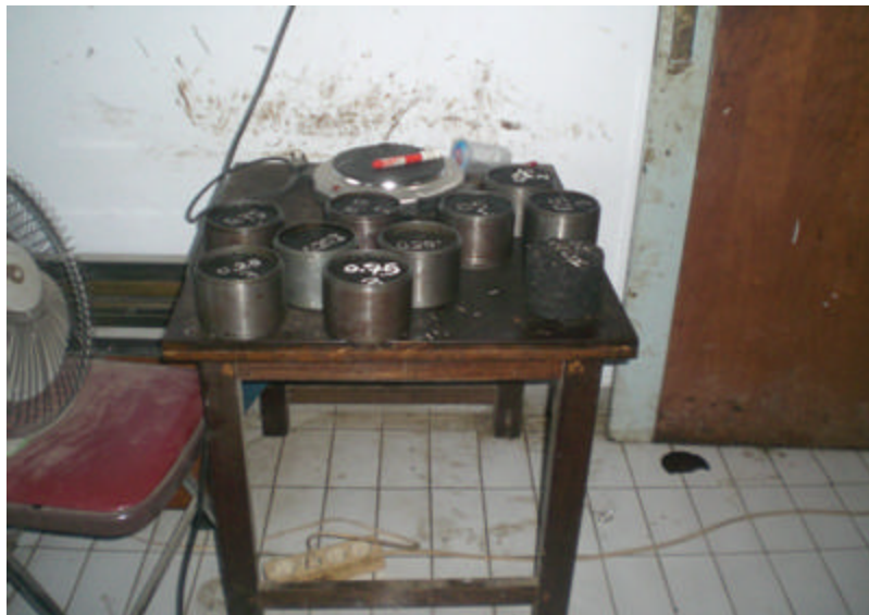
Gambar D12. Hasil Penumbukan Campuran