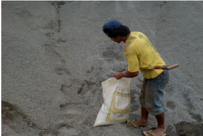
Gambar D5. Pengambilan agregat halus