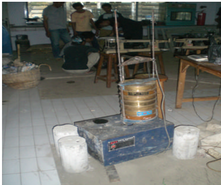
Gambar D6. Analisa Saringan