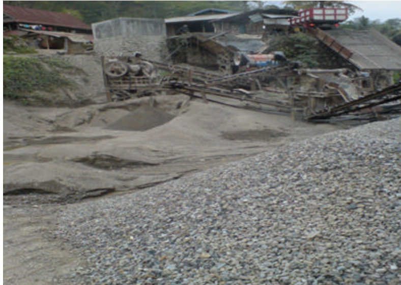
Gambar D1. Peralatan stone crusher