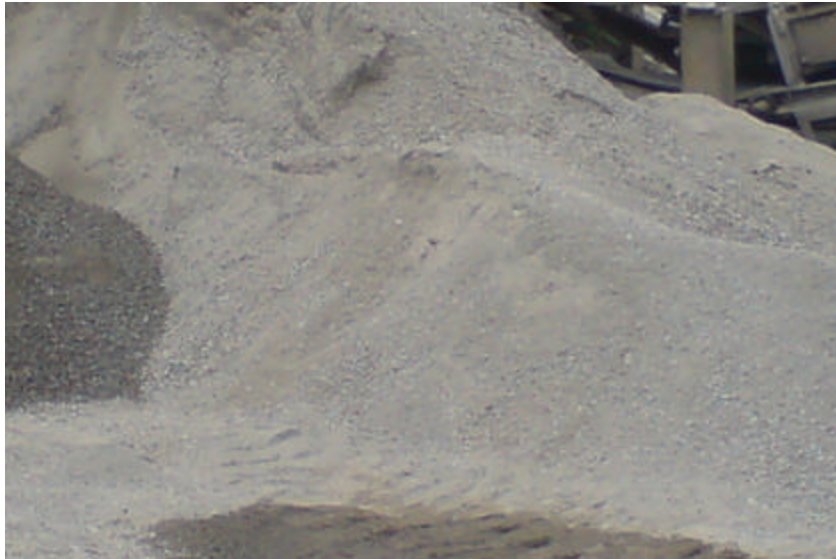
Gambar D3. Lokasi penumpukan agregat halus