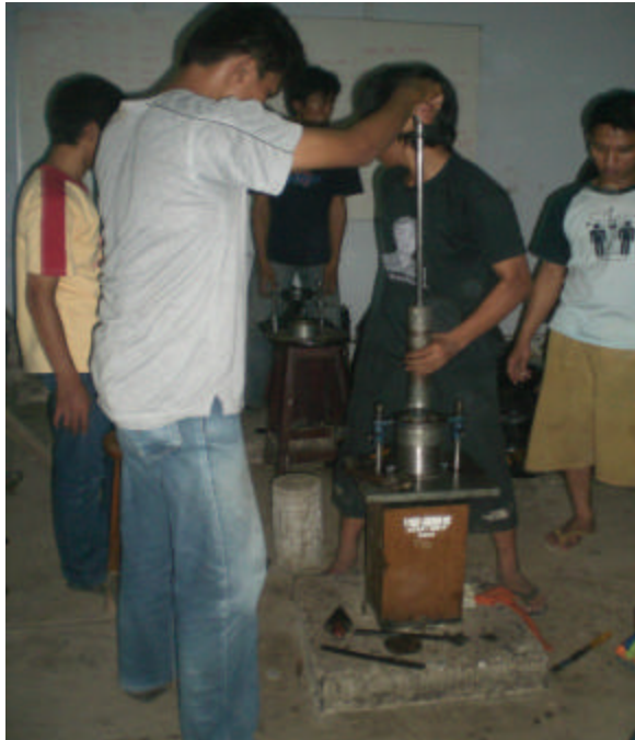
Gambar D11. Penumbukan Campuran Dalam Mold