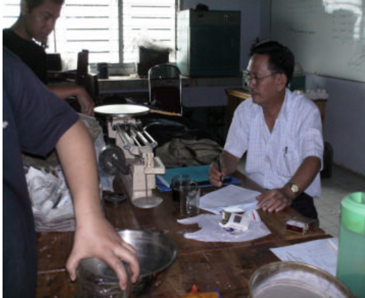
Gambar D7. Penimbangan Agregat