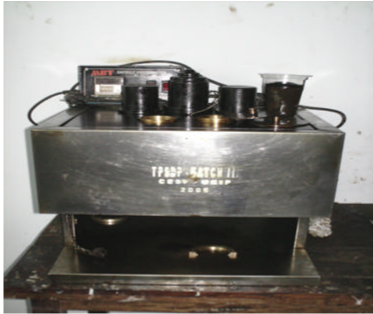
Gambar D17. Alat Viscositas