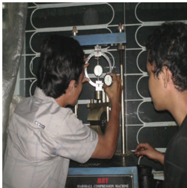
Gambar D16. Pengujian Marshall