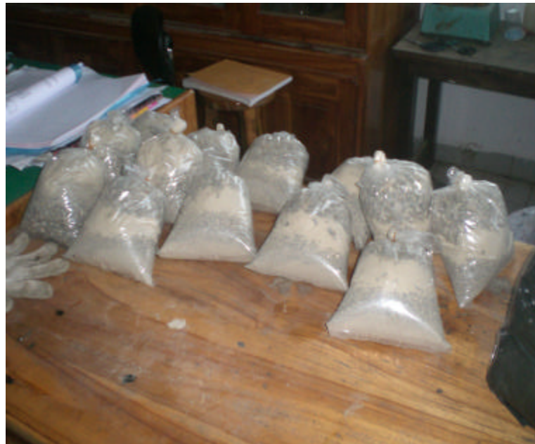
Gambar D8. Agregat Campuran