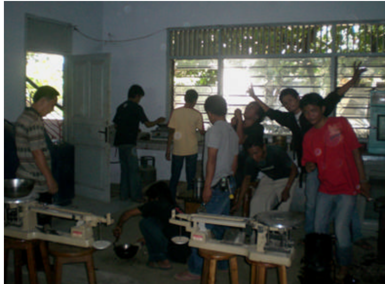
Gambar D10. Pencampuran Agregat dan Aspal