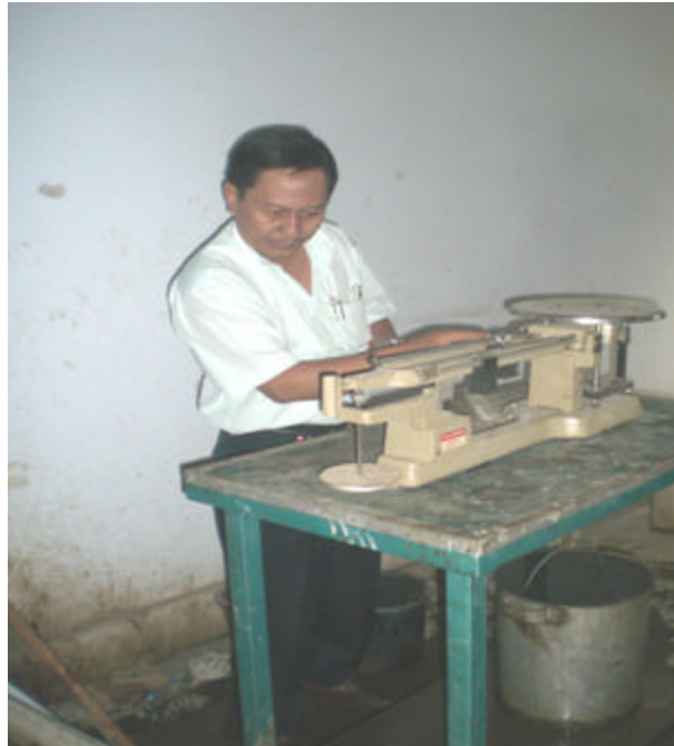
Gambar D15. Penimbangan Benda Uji Dalam Air