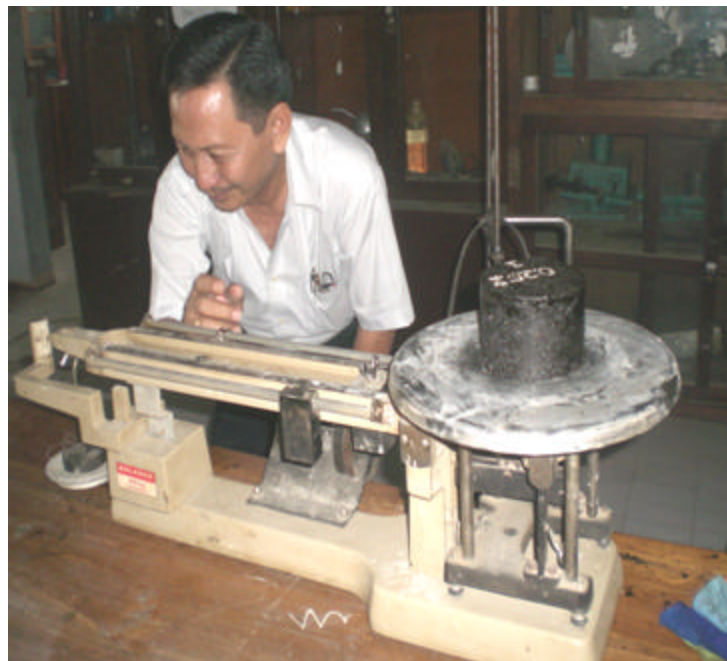
Gambar D14. Penimbangan Benda Uji