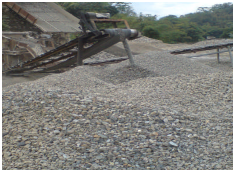
Gambar D2. Lokasi penumpukan agregat kasar