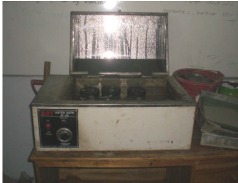
Gambar D13. Alat Perendaman ( Water Bath )