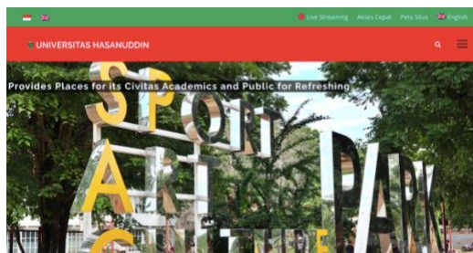
Figure 6. Unhas' website in 2020.