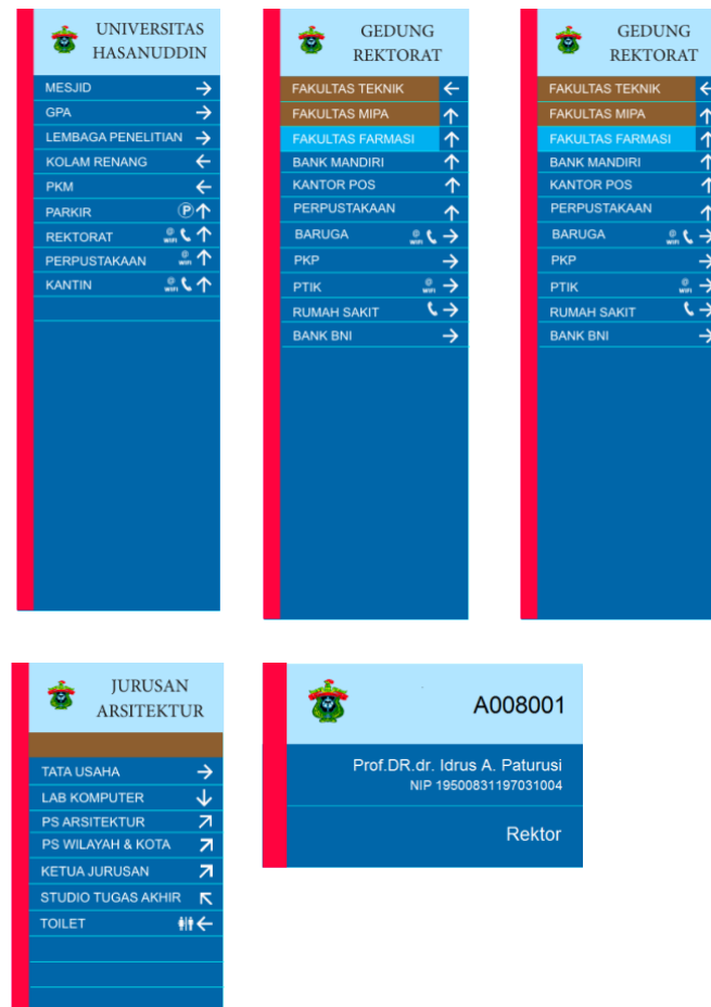
Figure 4: Color Schematic in Wayfinding System. 1

The red color also dominates the exterior and interior, such as in the Faculty of Medicine and Research Institutions. Its conspicuous presence symbolically seems as if this is an institution related to fire fighting activities or one of Indonesia's parties, namely PDIP. The vulgar use of red was also present on the university website in 2012. In 2020 the website was dominated by green to display visual perceptions as green university. The philosophy of the green university originating from green architecture is the concept of environmentally friendly energy management.