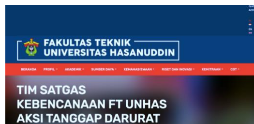
Figure 7: Faculty of Engineering's website in 2021.