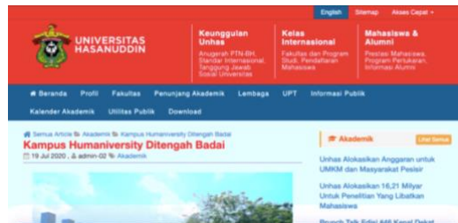
Figure 5. Unhas' website in 2020.

Ideally, the concept of institutional color is designed in an integrated manner and involves the entire concept of the institution's visual image. This concept must also be a guide to be implemented consistently by all work units so that there is no different interpretation. Thus, the public's imagination of the institution will be easily formed.