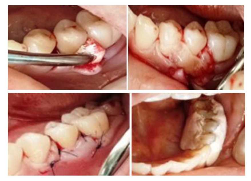
Figure 4 Application bone graft, PRF, Suturing and dressing