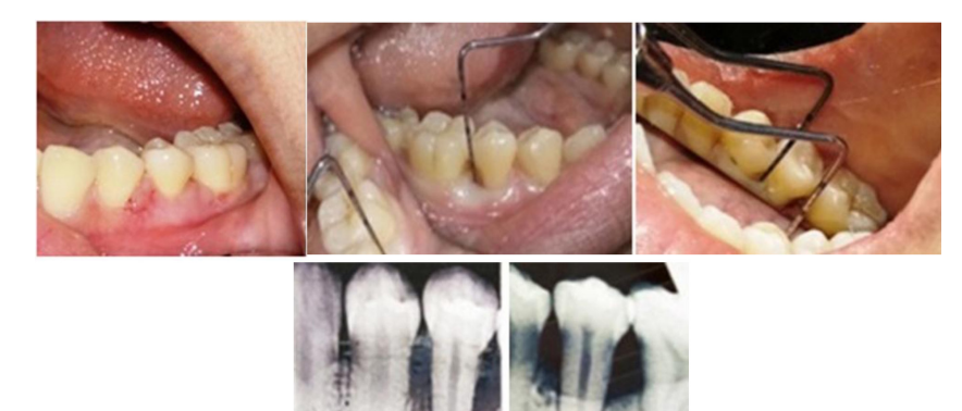
Figure 5 A week post surgery, Six months after surgery, Periapical radiography before and six months after surgery

for periodontal regeneration.<sup>11</sup> PRFconsists of a fibrin matrix polymerized with the incorporation of platelets, leukocyte, and cytokines, and circulating stem cells with a specific slow release of growth factors and glycoproteins.<sup>12</sup> An intermediate layer after centrifuge called "buffy coat" or L-PRF where most leucocytes and platelets are concentratedthat stimulates the local environment for differentiation and proliferation of stem and progenitor cells. It acts as an immune regulation node with inflammation control abilities.<sup>13</sup>