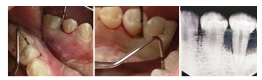
Figure 1 Initial examination

A 21-year-old female was reported to Department of Periodontics Faculty of Dentistry Hasanuddin University, Makassar, Indonesia with chief complaint tooth mobility and calculus. Patient has a habit of chewing only on the right side. Initial examination revealed grade two mobility of 35 with 9 mm distobuccal pocket depth figure 1 and 9 mm distolingual pocket depth. The Periapical radiograph revealed a large diffused periapical radiolucency reaching one-third of the tooth root 35. Scaling and root planing was performed and surgery was done a week later.