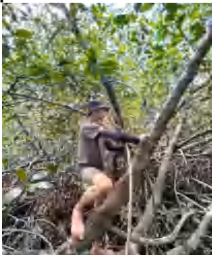
Gambar 1. Pengukuran lingkaran batang Mangrove