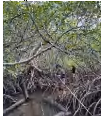
Gambar 2. Pengambilan Data mangrove