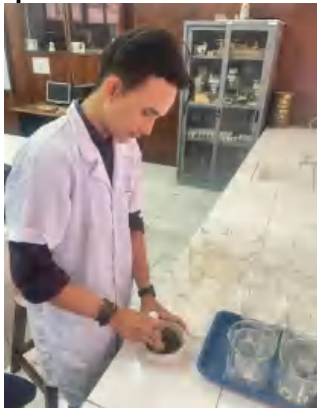
Gambar 5. Penghalusan Sampel