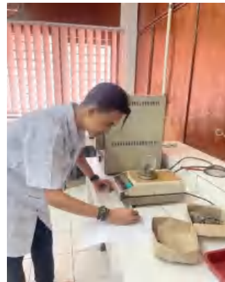
Gambar 6. Penimbangan Sampel