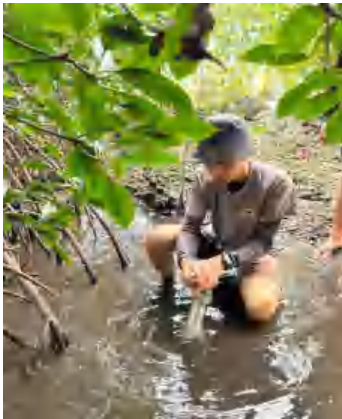
Gambar 3. Pengambilan Sampel Sedimen Pada Mangrove