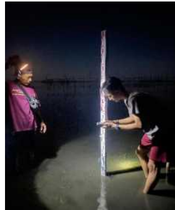
Gambar 4. Pengambilan Data Pada Pasang surut