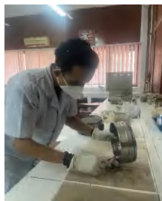
Gambar 8. Pemilahan Ukuran Butir