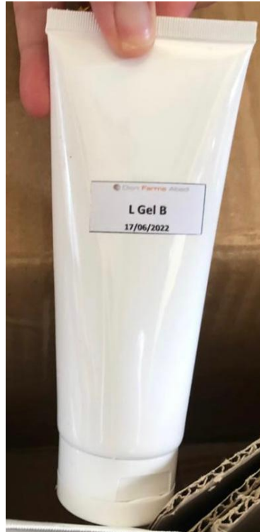
BERISI LACTOCOCCUS FERMENT LYSATE