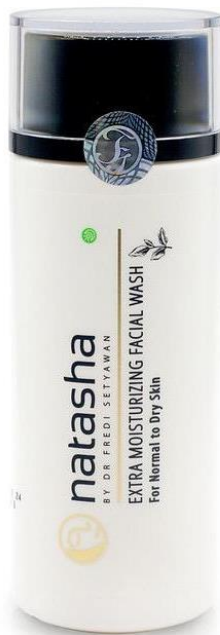
SABUN PEMBERSIH WAJAH