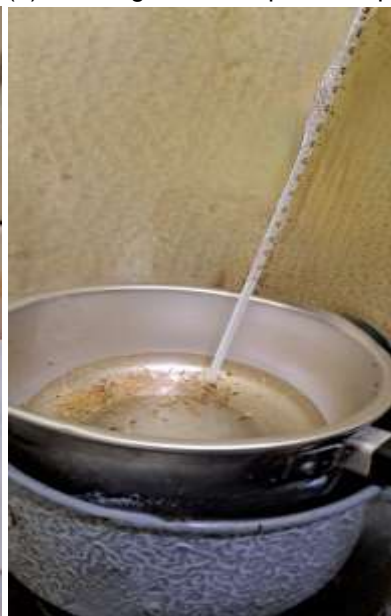
(c). Pengukuran air 100 ml ; (d) Perebusan kayu sanrego dengan suhu 90°C, kemudian diangkat dan diamkan selama 15 menit