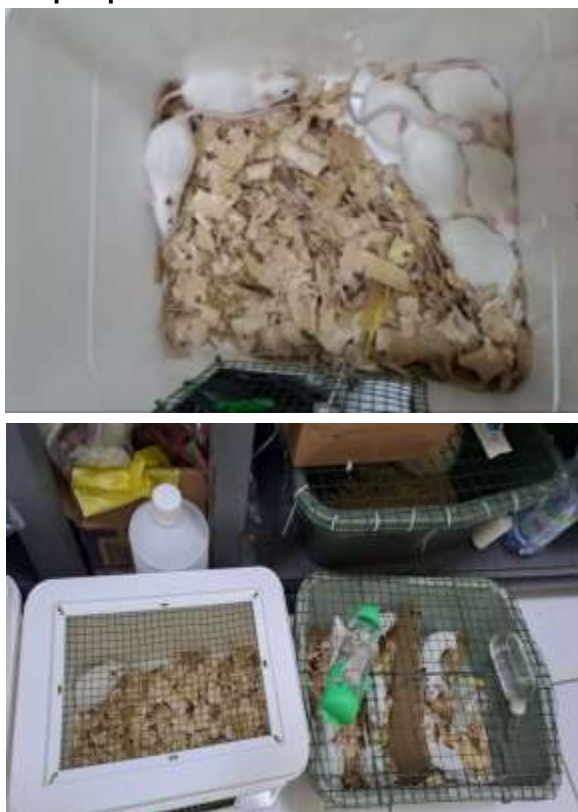
Pembagian kelompok mencit sesuai dengan dosis perlakuan