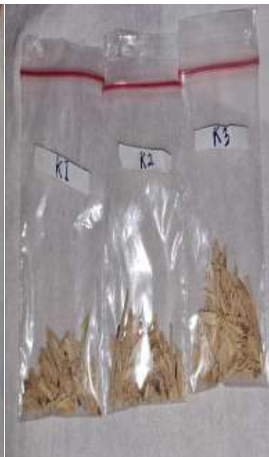
(a) Penimbangan dosis ; (b) Pembagian dalam plastik klip