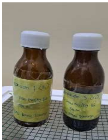
(e) Infusa kayu sanrego dimasukan kedalam botol sebagai stock dan siap digunakan