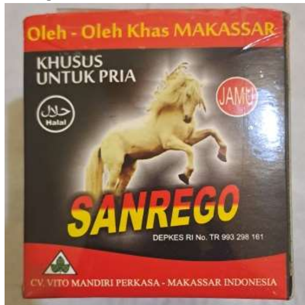
a. Kemasan Kayu sanrego