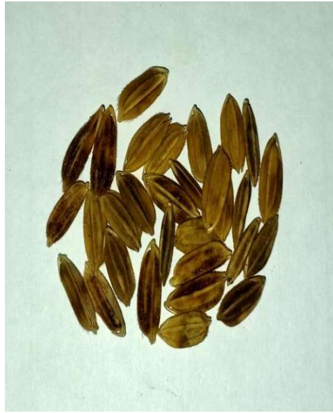
Gambar Lampiran 2. Bulir padi bergejala penyakit busuk bulir bakteri