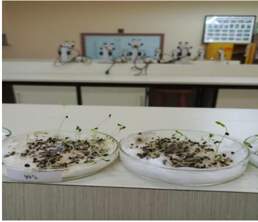
Ket : Hari kesebelas disemai