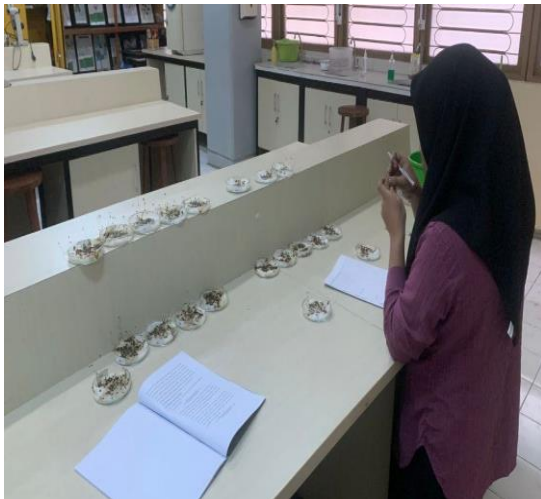
Ket : Pengukuran tinggi kecambah