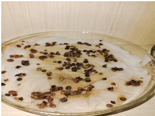
Ket : Hari ketujuh disemai