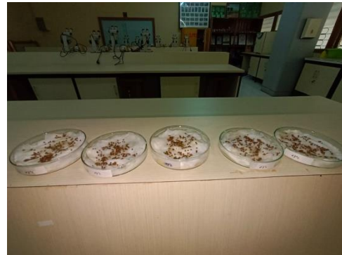
Ket : Hari kedua disemai