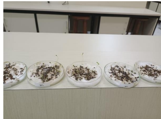
Ket : Hari kedelapan disemai