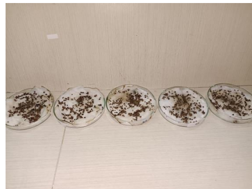
Ket : Hari keempat disemai