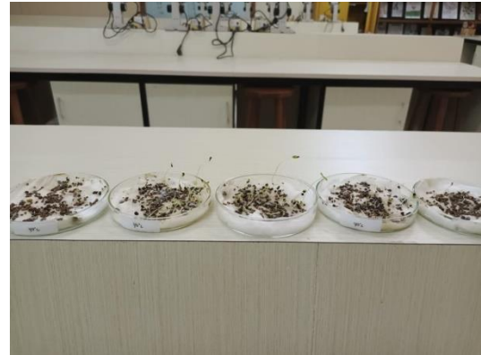
Ket : Hari keenam disemai