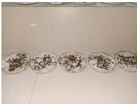
Ket : Hari ketiga disemai