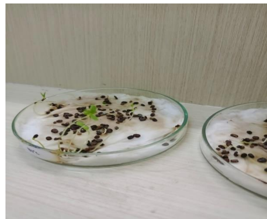
Ket : Hari kesepuluh disemai