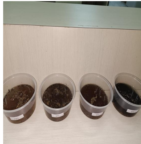
Ket : Alat dan bahan yang digunakan Ket : Biji Indigofera direndam selama 24 jam