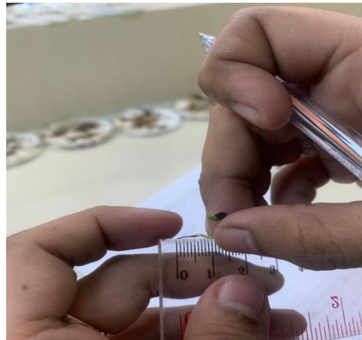
Ket : Pengukuran panjang akar primer