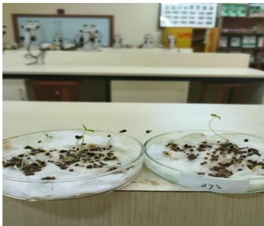
Ket : Hari kesembilan disemai