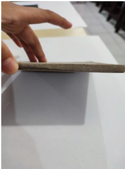
Gambar 2. Bahan Penelitian