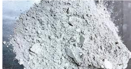
Ordinari Portland Cement (OPC)