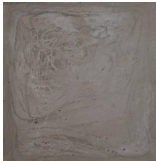
Gambar 3. Hasil Penelitian