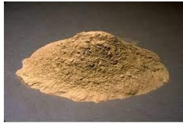
Fly Ash (FA)