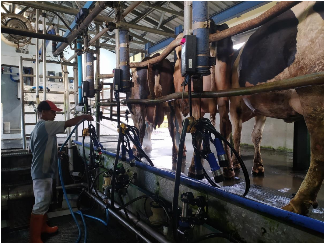
Lampiran 2. Pembersihan ambing sebelum proses pemerahan.