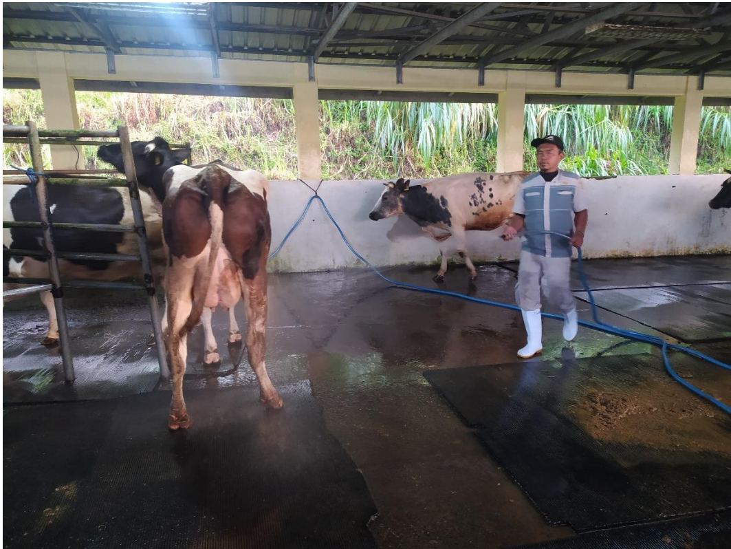
Lampiran 1. Proses pemandian sapi sebelum pemerahan.