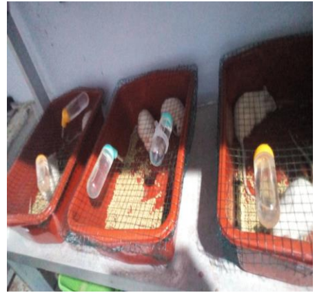
Sampel tikus Wistar