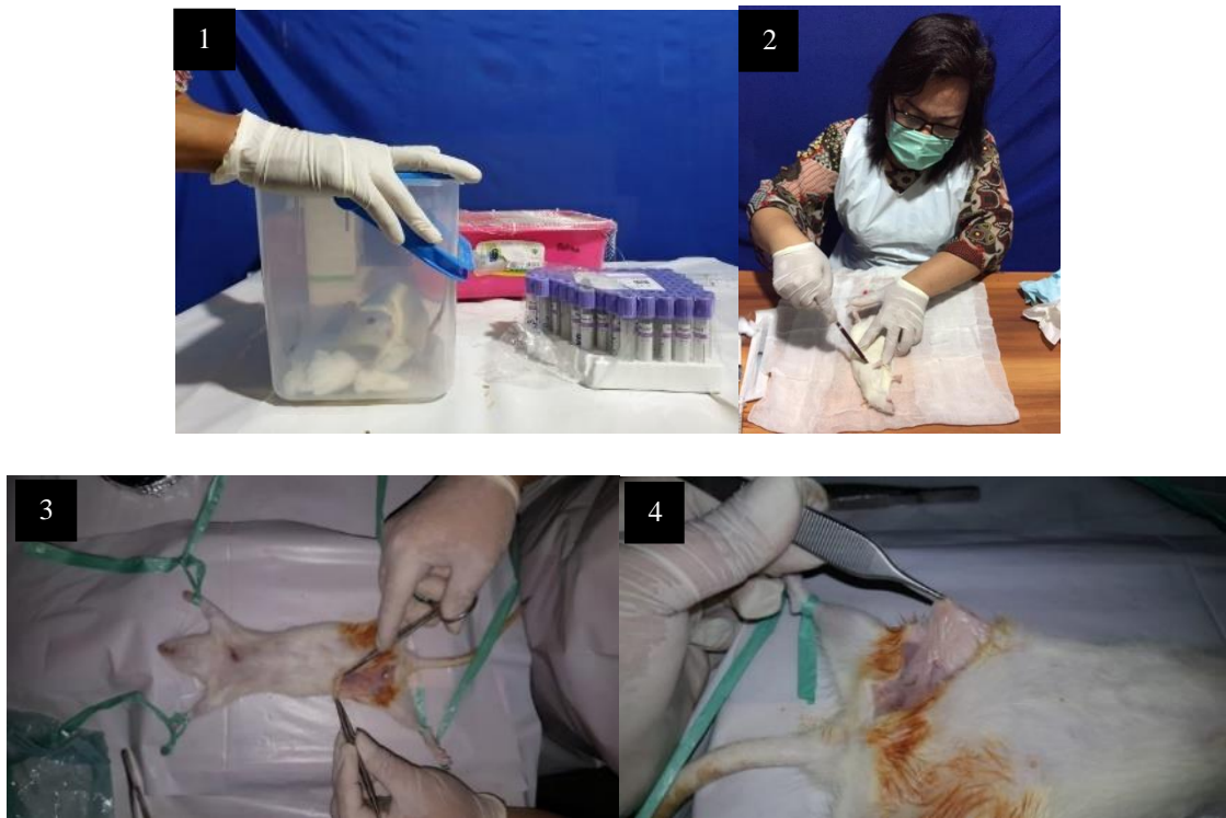
Proses pengambilan Donor PRP dan SVFs (Insert: Gambar 1. Pembusuan dengan Eter fisiologis. 2. Pengambilan Donor PRP. 3 dan 4. Pengambilan Donor SVFS)