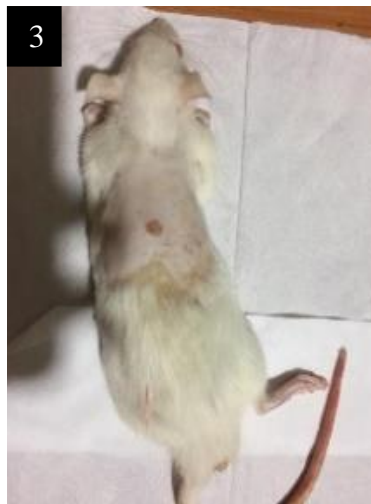
Perlakuan Injeksi PRP dan SVFs. (Insert: Gambar 1. Pencukuran Bulu Wistar. 2. Injeksi Stem cell. - 3. Lima lokasi injeksi Stem cell)