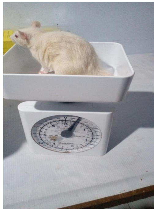
Menimbang BB tikus