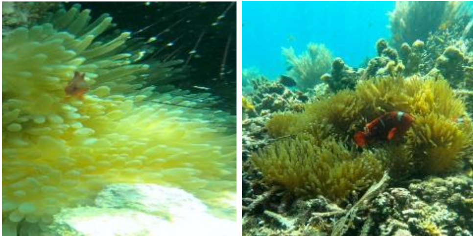
Entacmaea quadricolor dengan Amphiprion ocellaris dan Premnas biacelatus