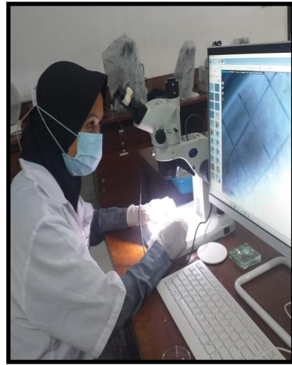
Identifikasi mikroplastik berdasarkan bentuk dan warna