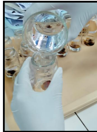
Penambahan KOH 10%