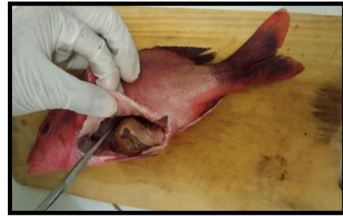
Pengambilan saluran pencernaan ikan kembung Rastrelliger sp. dan ikan kakap Lutjanus sp.