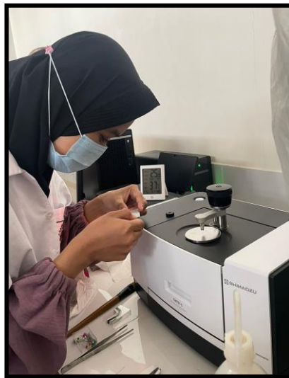
Uji Fourier Transform Infrared (FTIR)