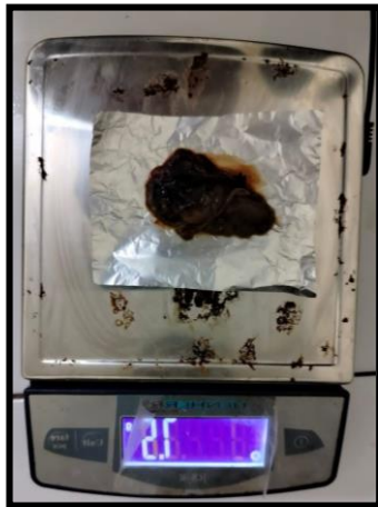
Penimbangan berat basah sampel