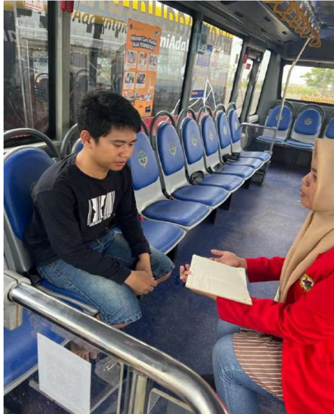
Wawancara bersama masyarakat pengguna Bus Trans Mamminasata pada 4 Juli 2023