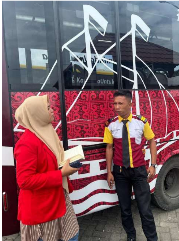
Wawancara bersama pramudi Bus Trans Mamminasata rute koridor 2 pada 4 Juli 2023