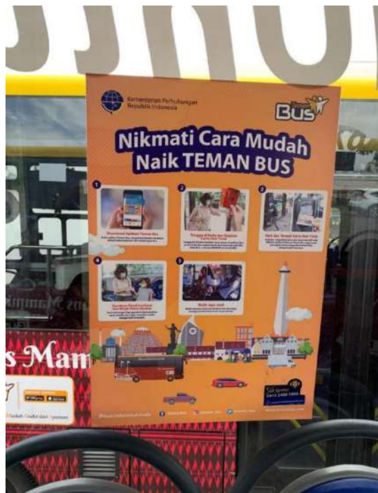
Prosedur penggunaan Bus Trans Mamminasata