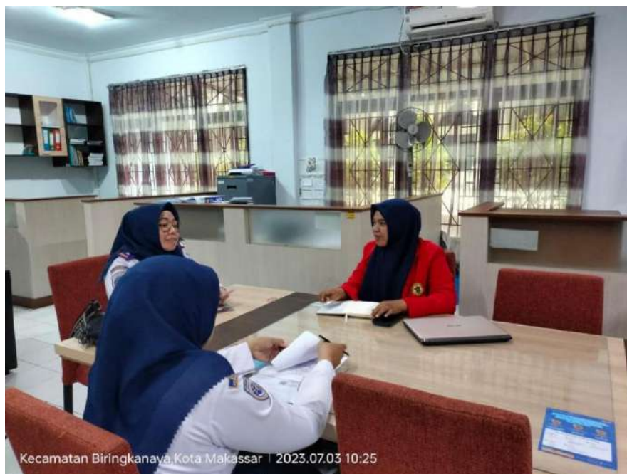
Wawancara bersama Kepala UPT Mamminasata dan kasi kendaraan dan transportasi pada 3 Juli 2023