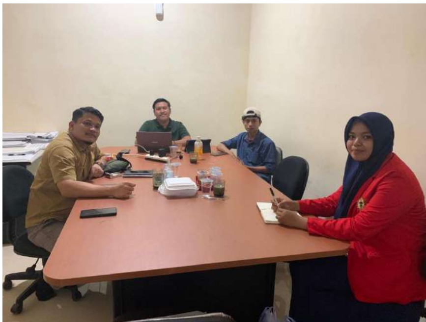
Wawancara bersama kepala PT. Sinar Jaya, Staff PT. TKDN, dan PT. Surveyor Indonesia pada 3 Juli 2023