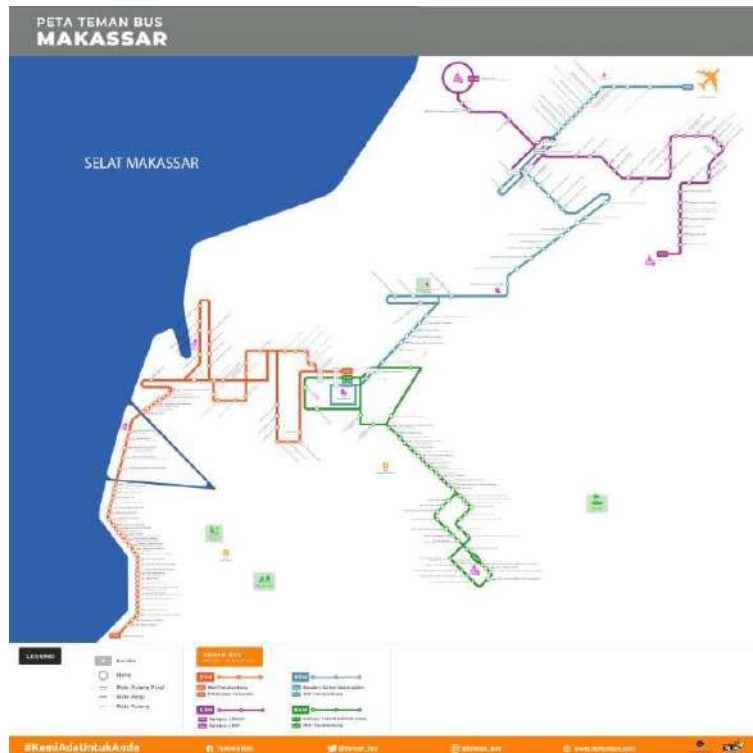
Rute Bus Mamminasata