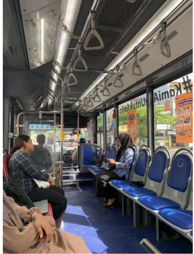
Kondisi didalam Bus Trans Mamminasata