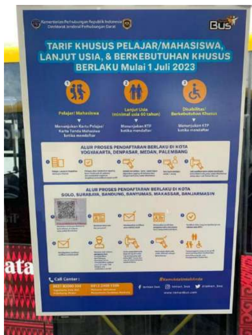
Tarif khusus pelajar/mahasiswa, lanjut usia, & berkebutuhan khusus