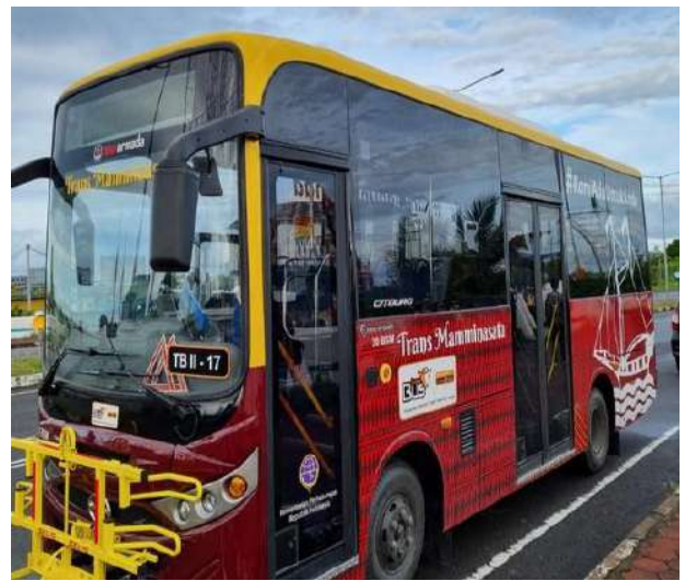
Kondisi diluar Bus Trans Mamminasata