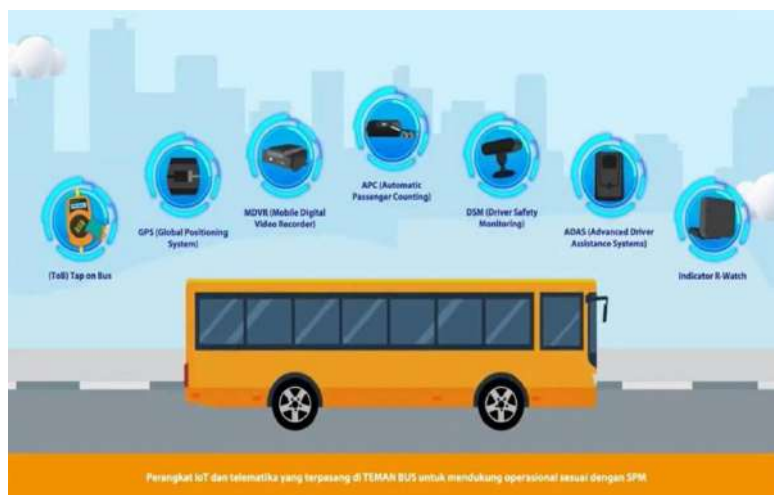
Perangkat IoT untuk kenyamanan penumpang