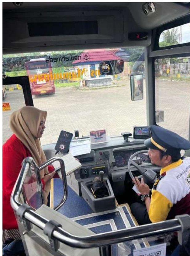
Wawancara bersama pramudi Bus Trans Mamminasata rute koridor 2 pada 4 Juli 2023