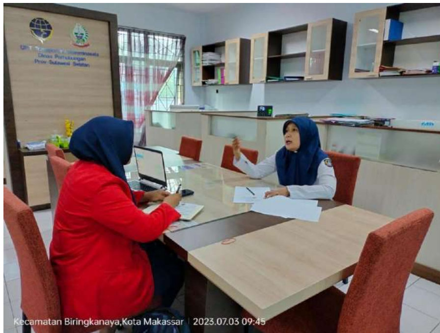
Wawancara bersama kasi kendaraan dan transportasi pada 3 Juli 2023