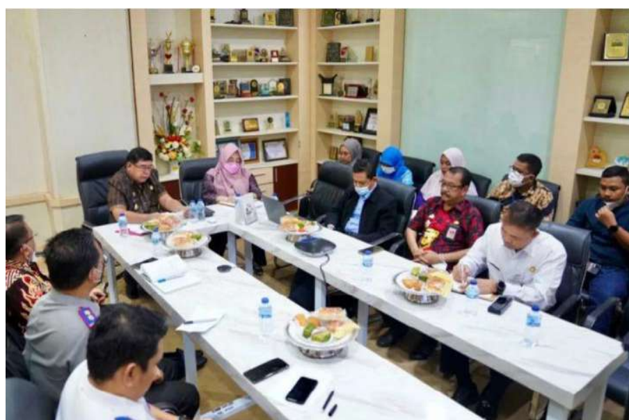
Rapat koordinasi untuk penetapan tarif khusus pada 3 Juli 2023