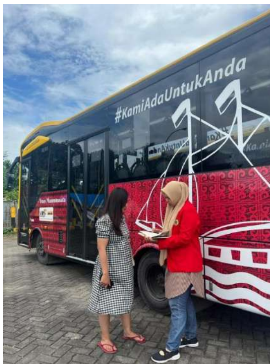
Wawancara bersama masyarakat pengguna Bus Trans Mamminasata pada 4 Juli 2023