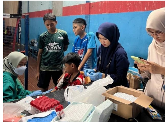
Proses Pemisahan Serum Darah