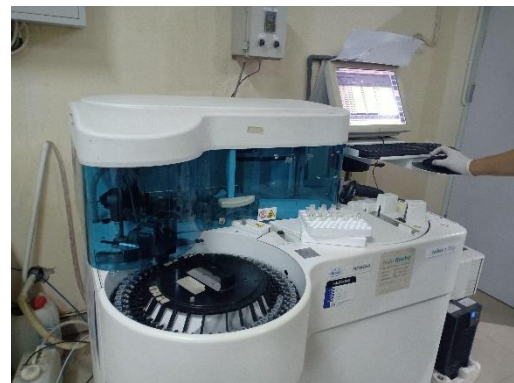
Alat Cobas C311