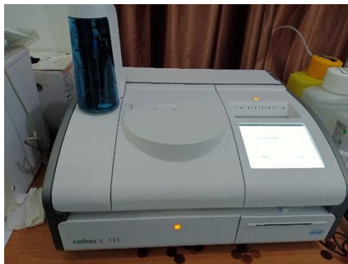
Alat Cobas C 111