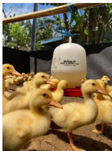
Itik pada masa starter