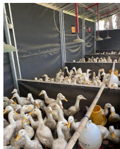
Itik pada masa grower