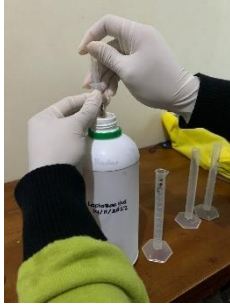
Pengambilan probiotik dari larutan induk