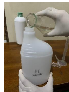
Probiotik dituang ke dalam botol spray