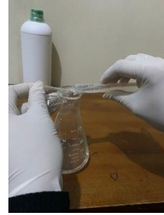
Probiotik dituang ke dalam erlenmeyer