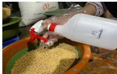
Spray pakan dengan probiotik