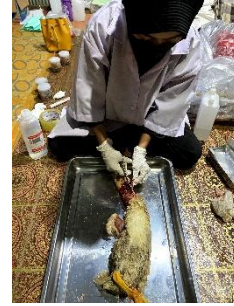
Pengambilan sampel hepar dan otot paha