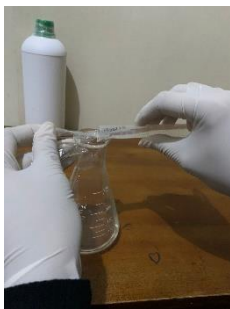
Air sebagai pelarut ditambahkan ke dalam erlenmeyer