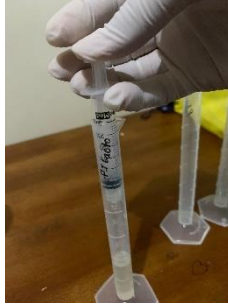
Probiotik diukur dengan gelas ukur