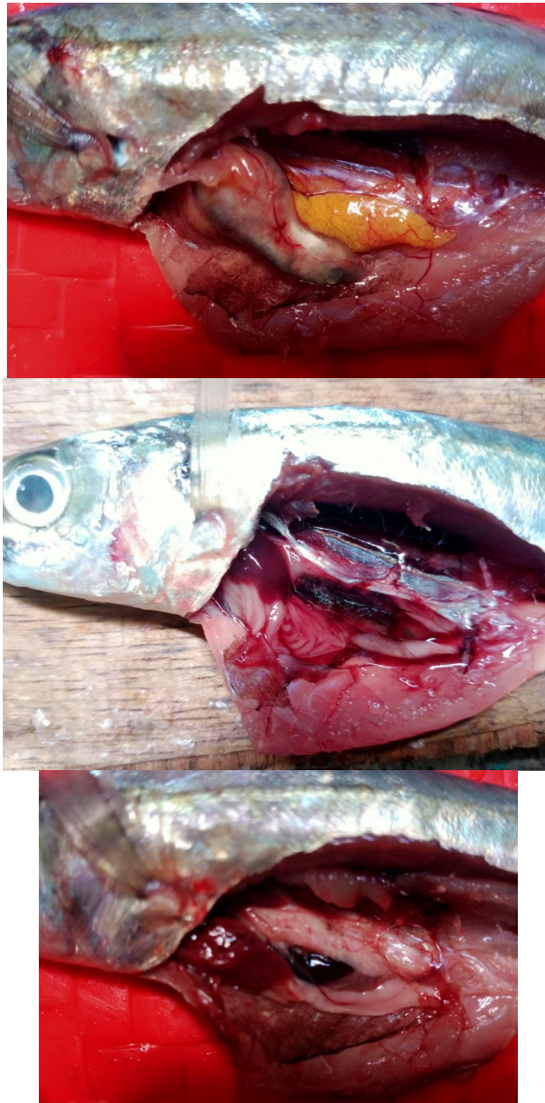
Gambar 26. Pembedahan sampel ikan layang ( Decapterus russelli ) untuk mengetahui tingkat kematangan gonad