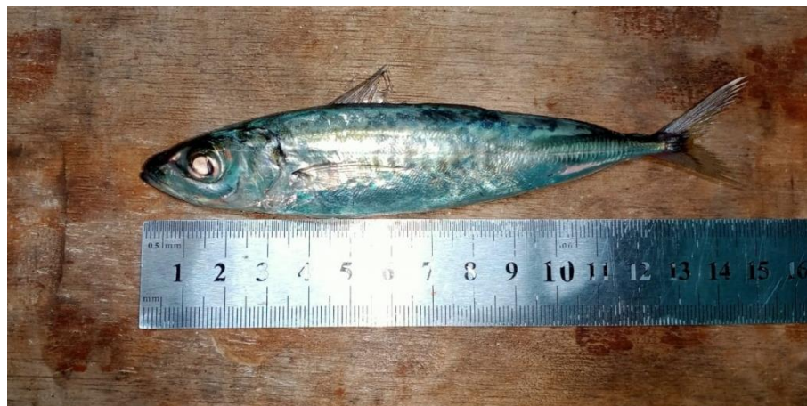
Lampiran 8. Foto kegiatan dan pengukuran serta pembedahan sampel selama di lokasi penelitian