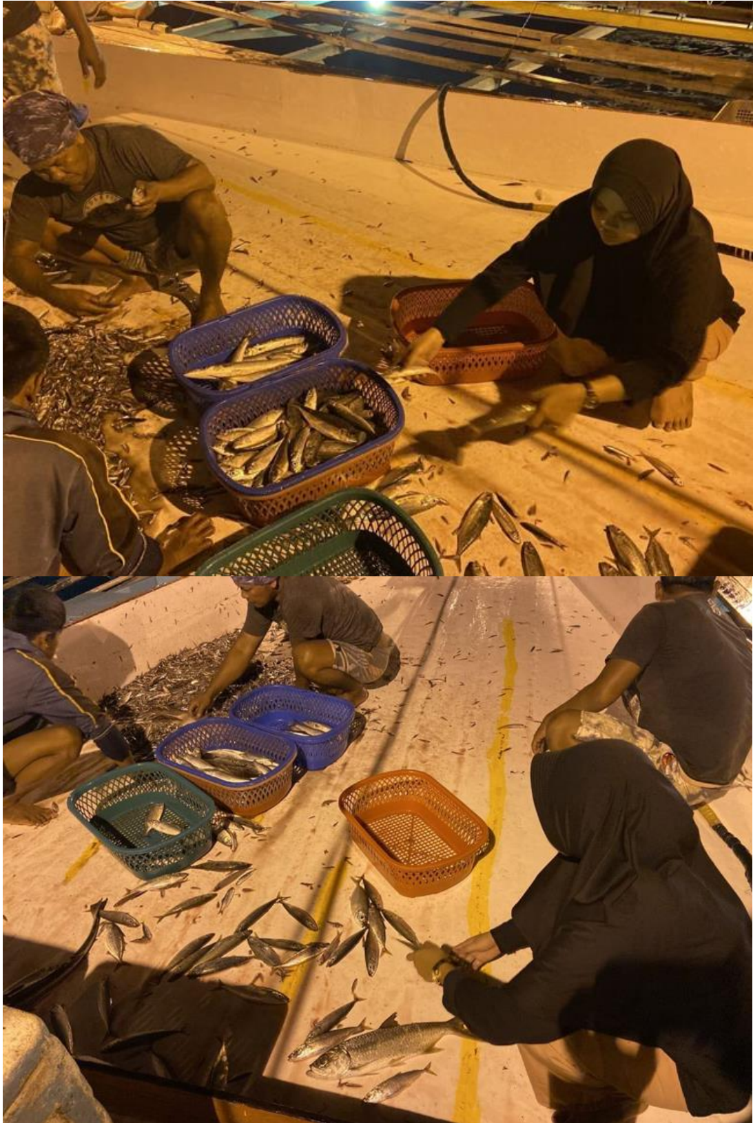
Gambar 27. Penyortiran ikan diatas bagan perahu