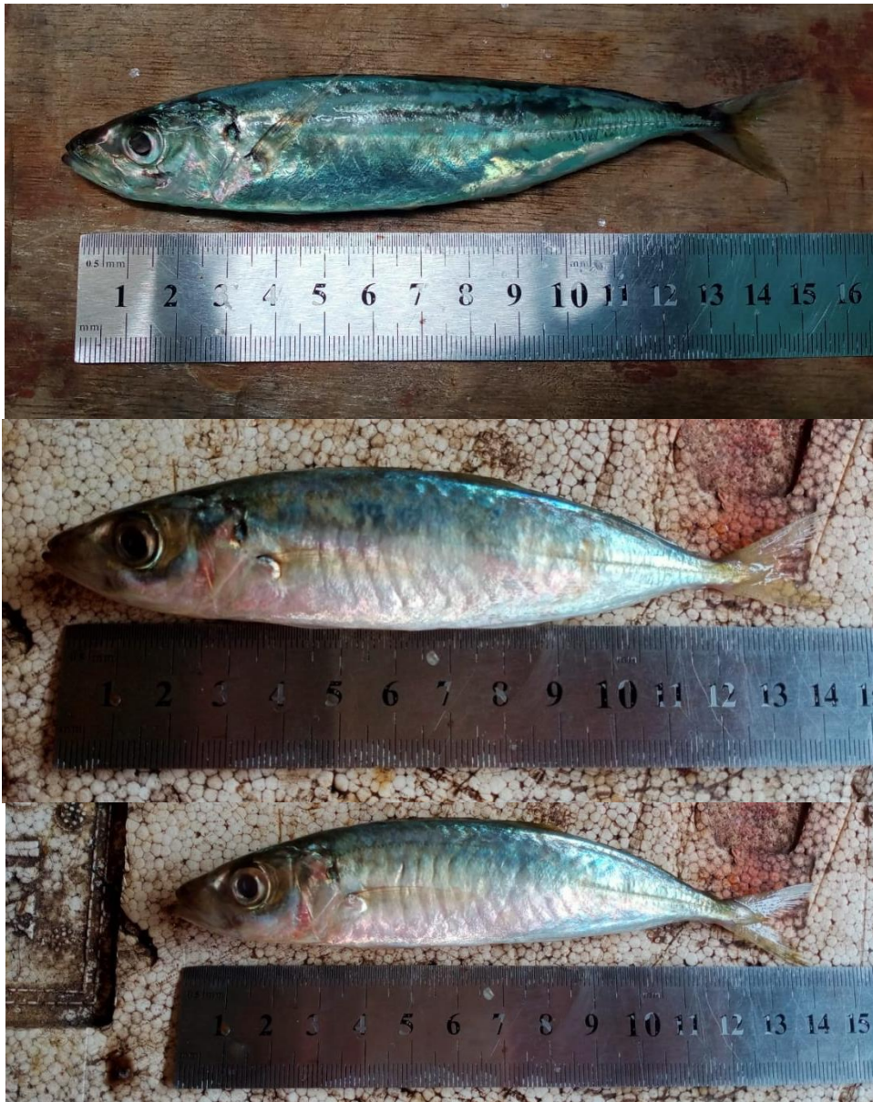
Gambar 25. Pengukuran panjang ikan layang ( Decapterus russelli )