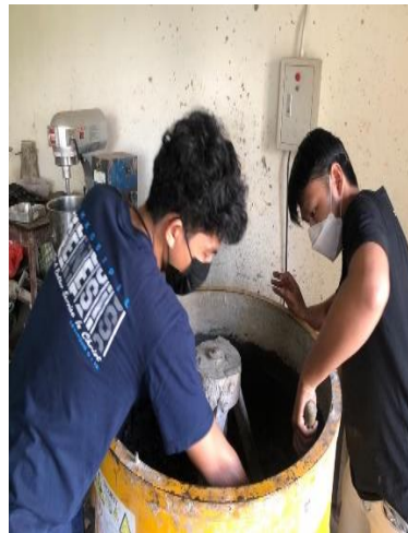
( proses pembuatan benda uji )