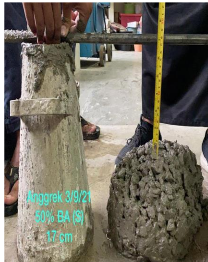
( proses pengujian slump )