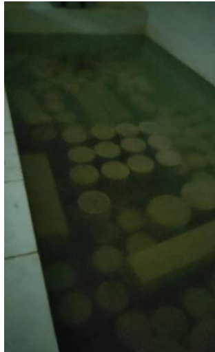
( proses perawatan benda uji/curing )