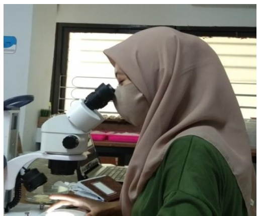
Pengamatan mikroplastik menggunakan mikroskop