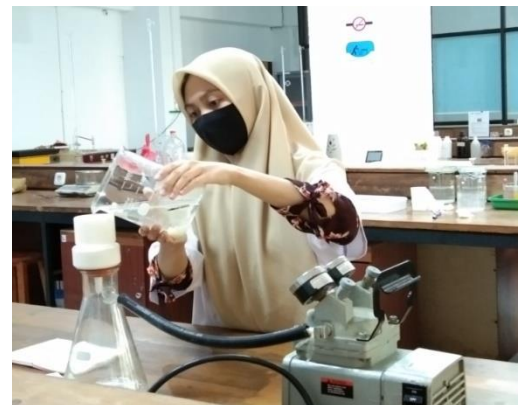
Sampel disaring menggunakan kertas saring whatmann dibawah vacum pump