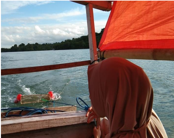
Pengambilan sampel air