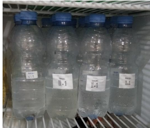
Penyimpanan sampel pada suhu 20°C