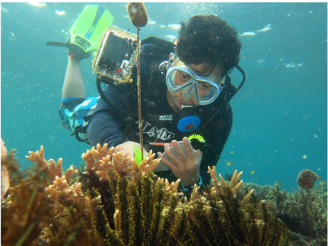
Gambar 12. Pengukuran Pertumbuhan Karang Alami.