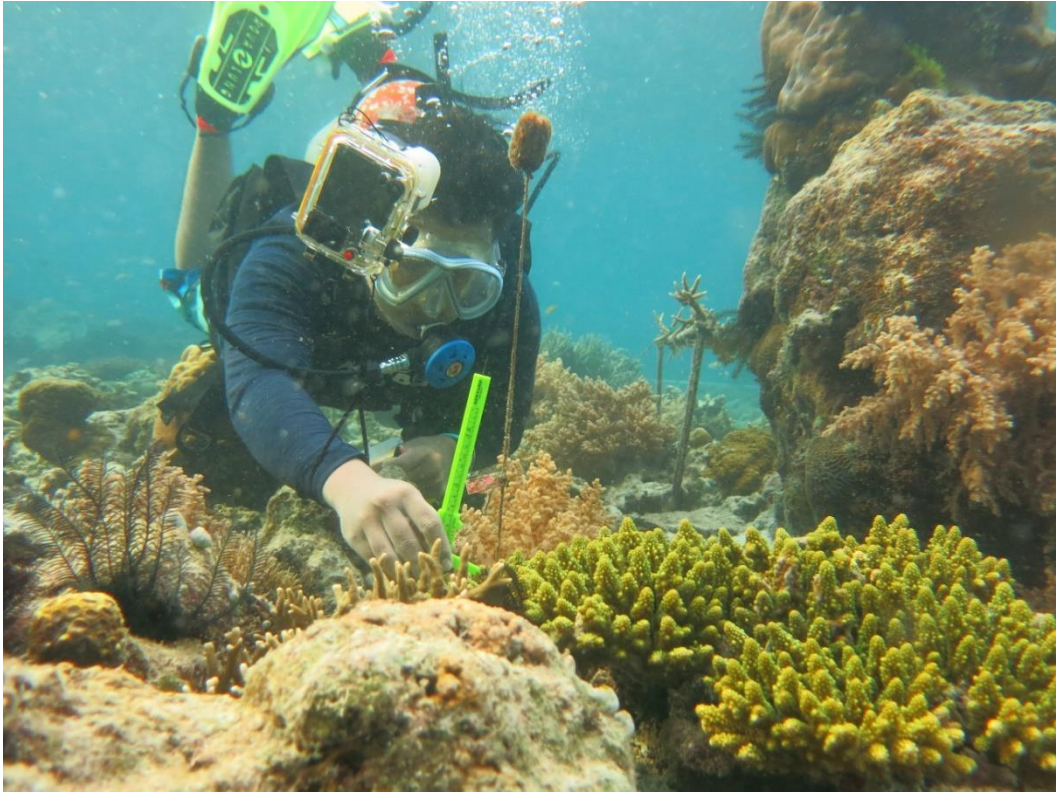
Gambar 13. Pengukuran Pertumbuhan Karang Alami.