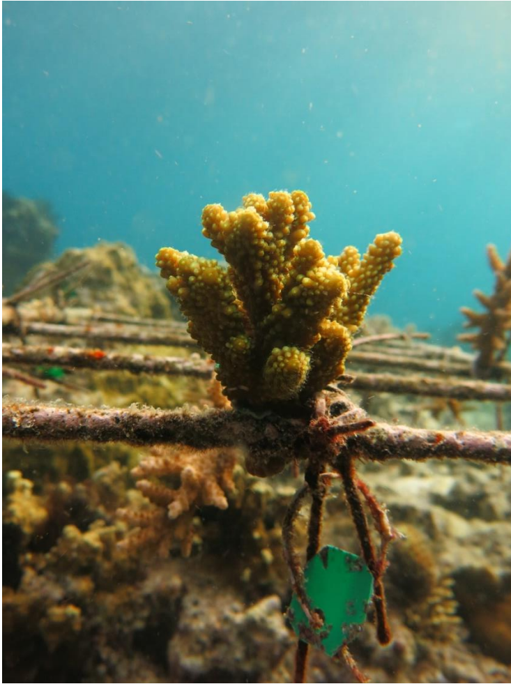
Gambar 15. Fragmen Karang Transplantasi.