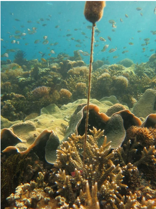
Gambar 18. Koloni Karang Alami.