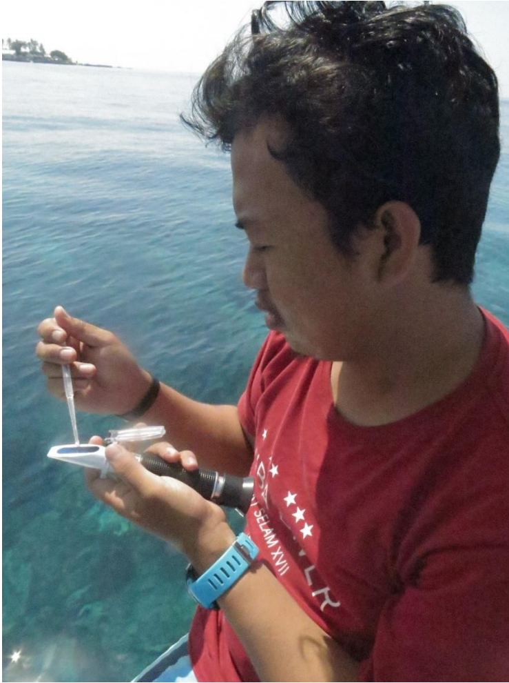
Gambar 3. Pengukuran Salinitas Perairan dengan Refraktometer.