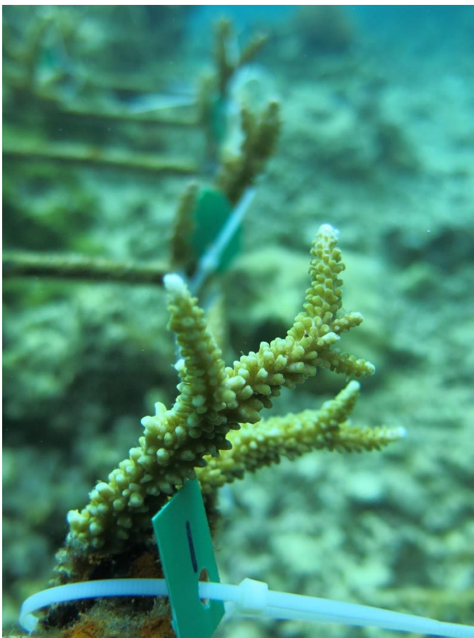
Gambar 2. Fragmen karang yang telah diberi tagging /tanda.