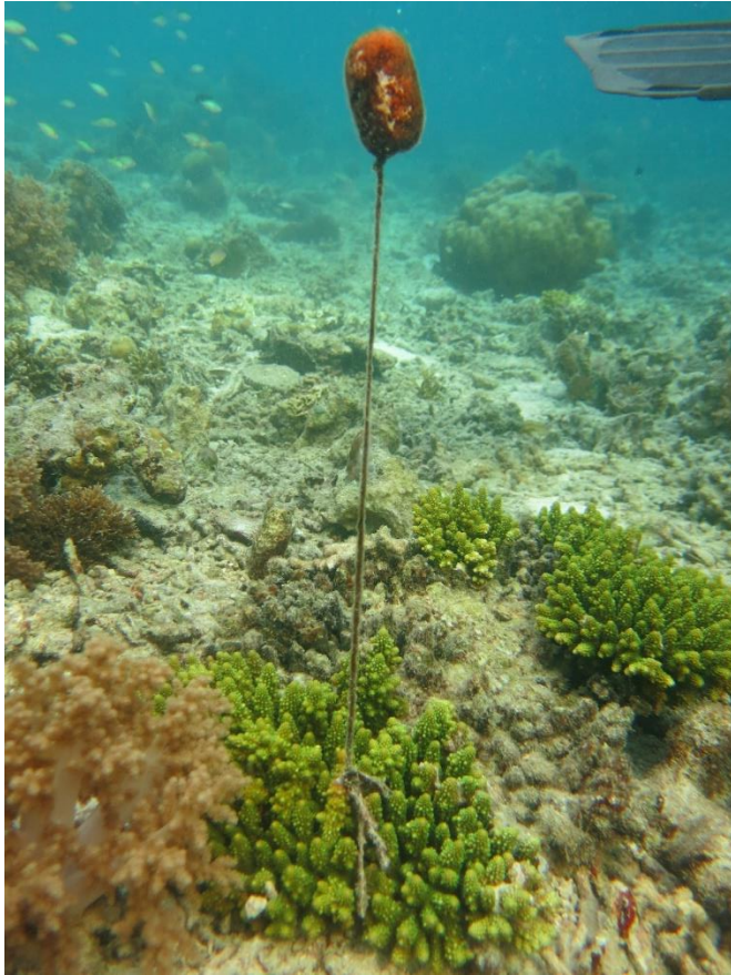
Gambar 19. Koloni Karang Alami.