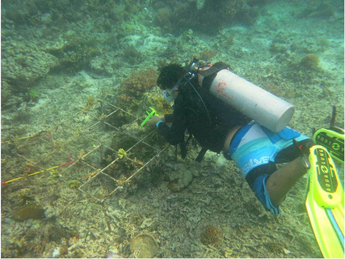
Gambar 5. Pengukuran Fragmen Karang Transplantasi.