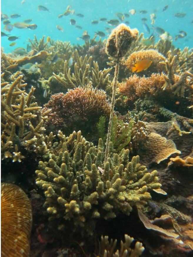
Gambar 17. Koloni Karang Alami.