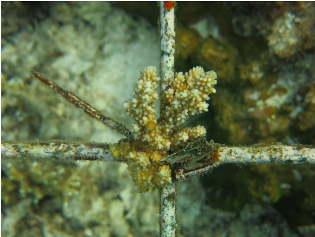
Gambar 16. Fragmen Karang Transplantasi.