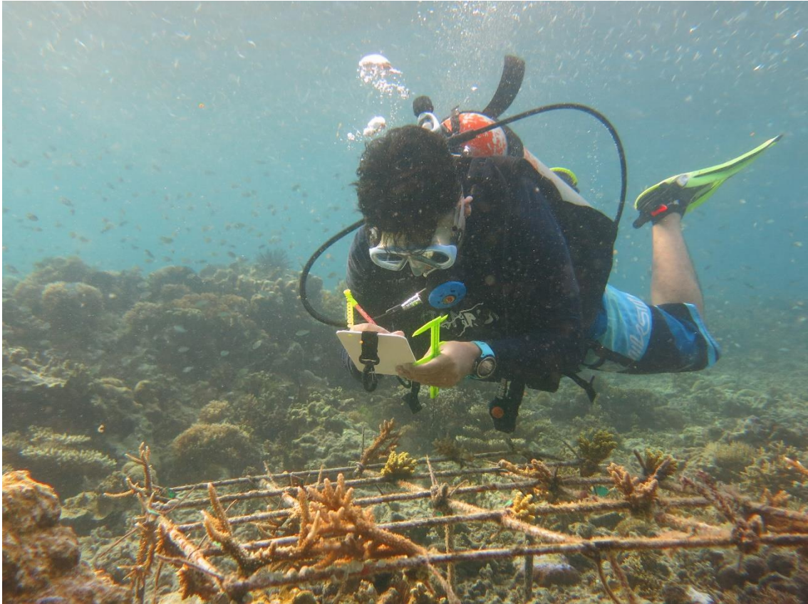
Gambar 7. Mencatat Hasil Pengukuran Fragmen Karang Transplantasi.