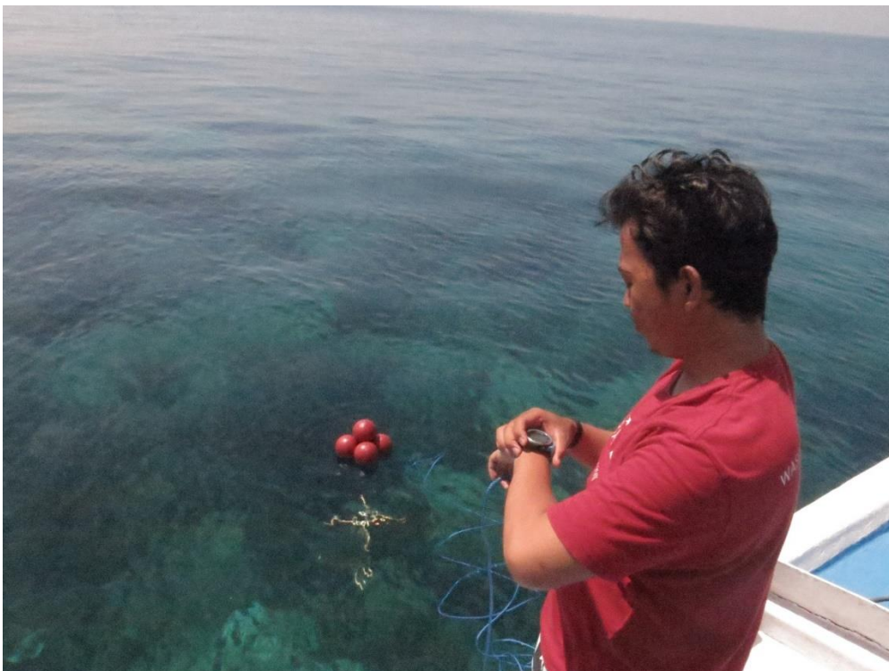
Gambar 4. Pengukuran Kecepatan Arus Perairan dengan Layangan Arus.