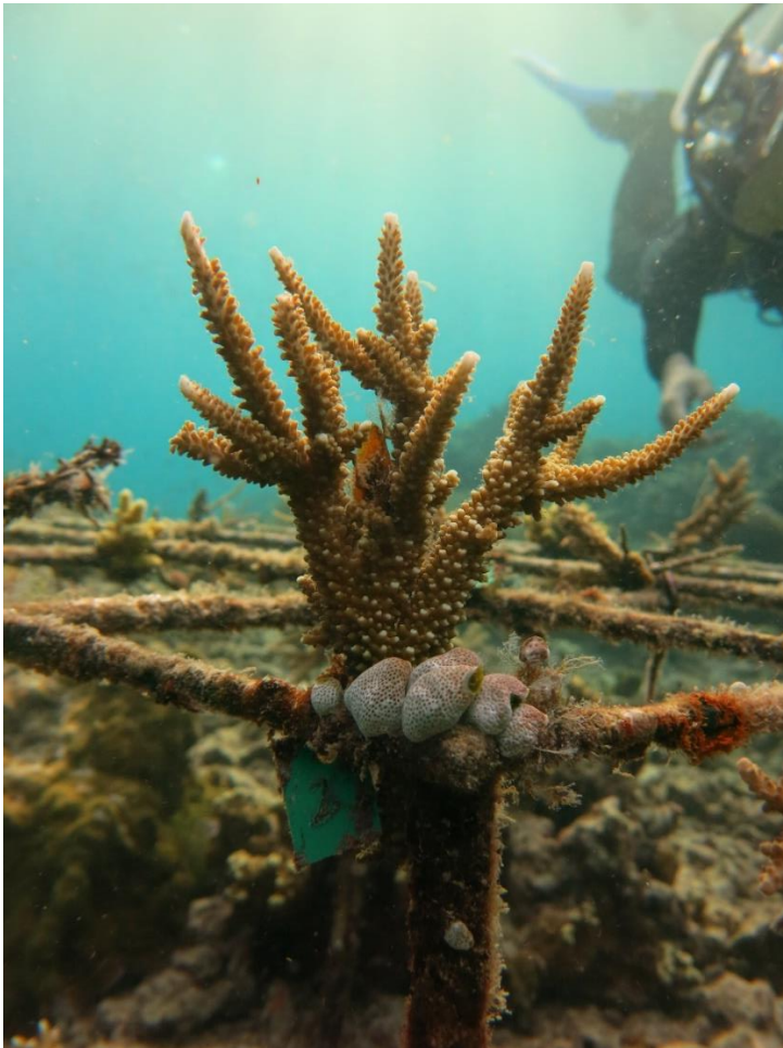
Gambar 14. Fragmen Karang Transplantasi.