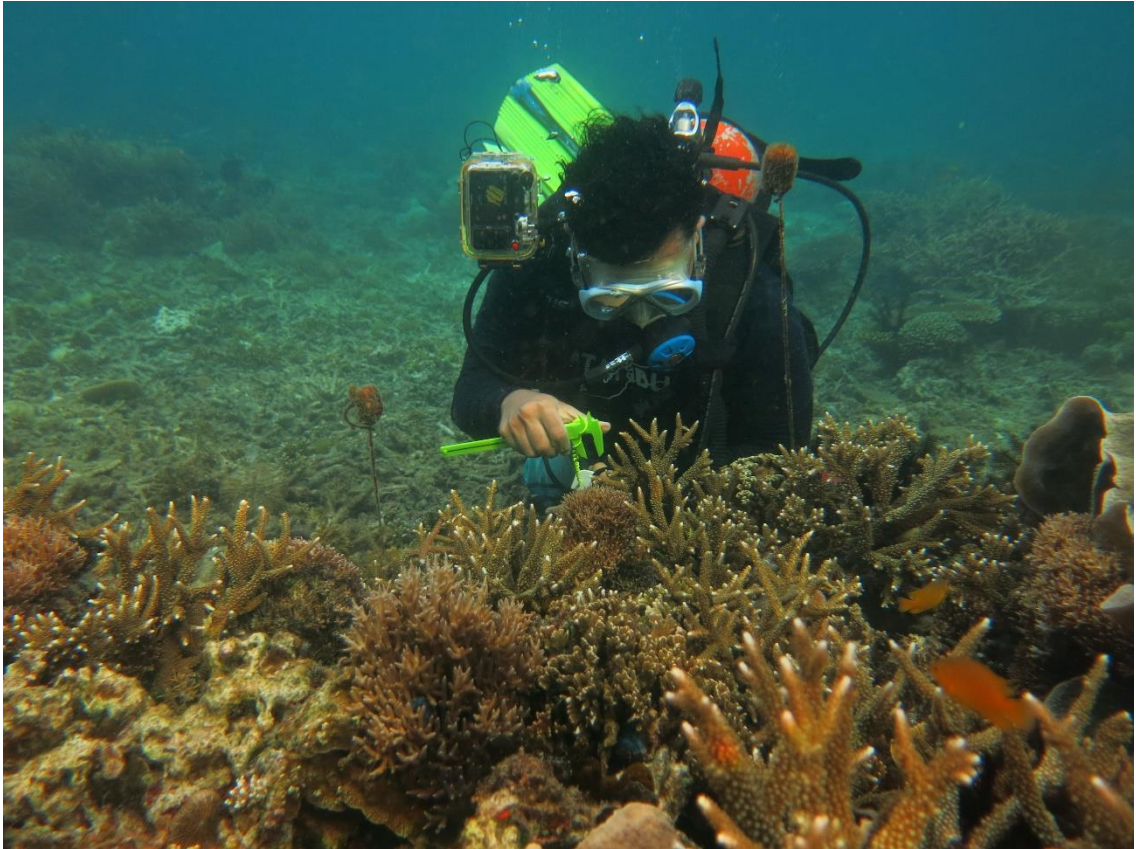
Gambar 11. Pengukuran Pertumbuhan Karang Alami.