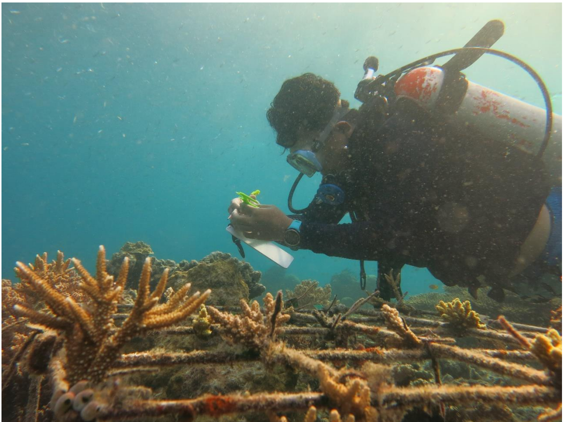
Gambar 6. Mencatat Hasil Pengukuran Fragmen Karang Transplantasi.