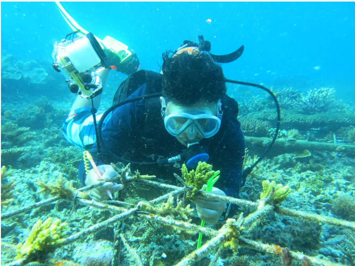
Gambar 8. Pengukuran Fragmen Karang Transplantasi.