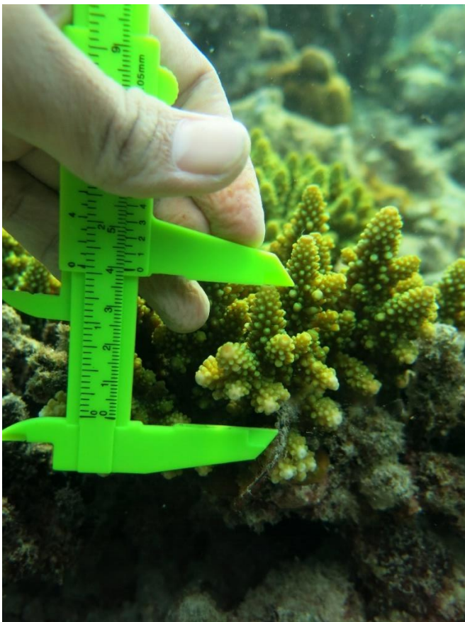
Gambar 20. Pengukuran Pertumbuhan Karang Alami.