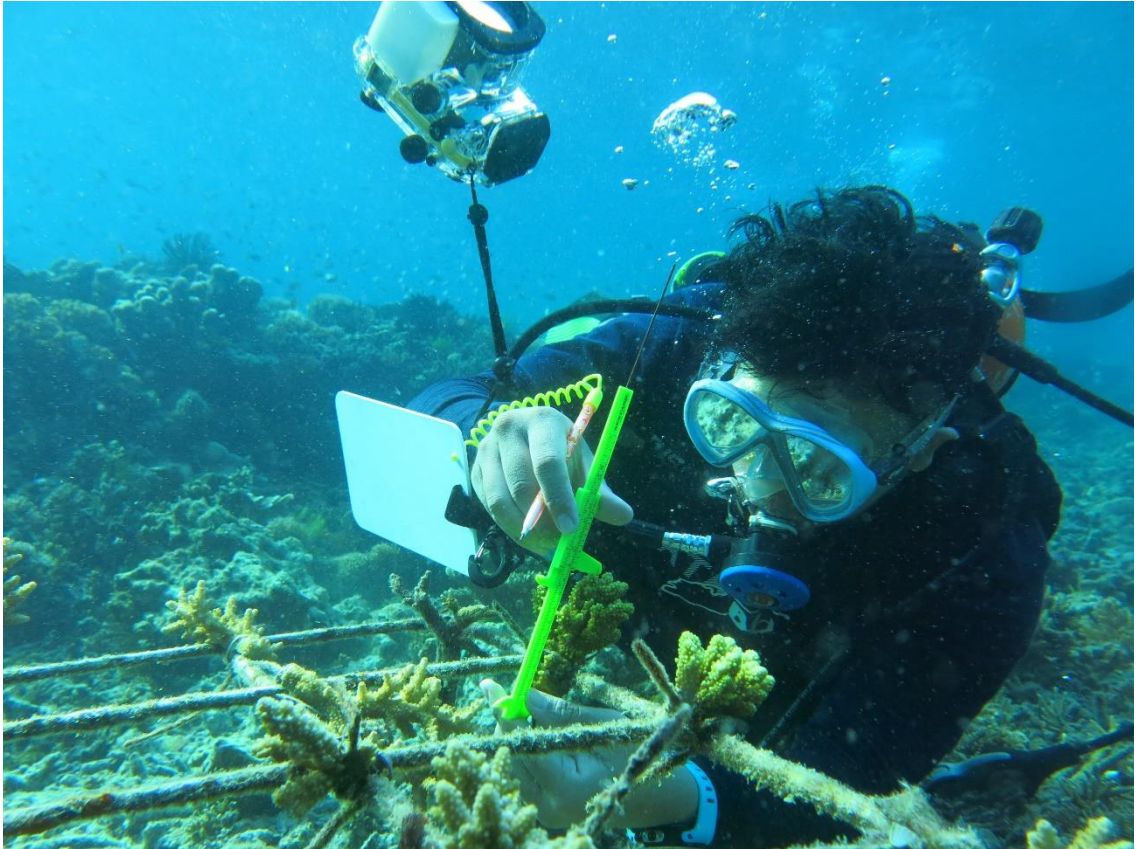
Gambar 9. Pengukuran Fragmen Karang Transplantasi.