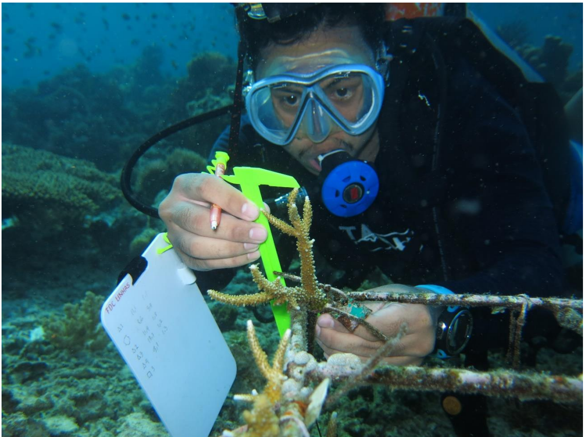
Gambar 10. Pengukuran Fragmen Karang Transplantasi.