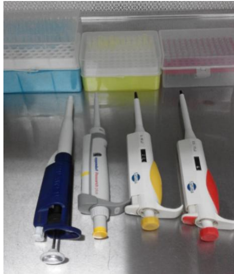
Mikropipet dan Tip