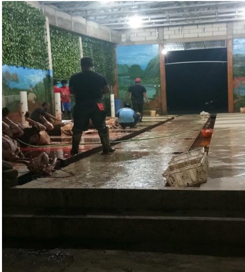
Pengambilan Ovarium di RPH