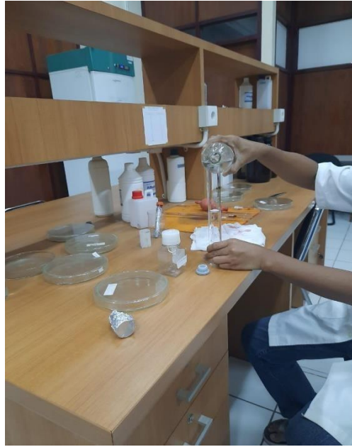
Proses Pembuatan Larutan Fiksasi