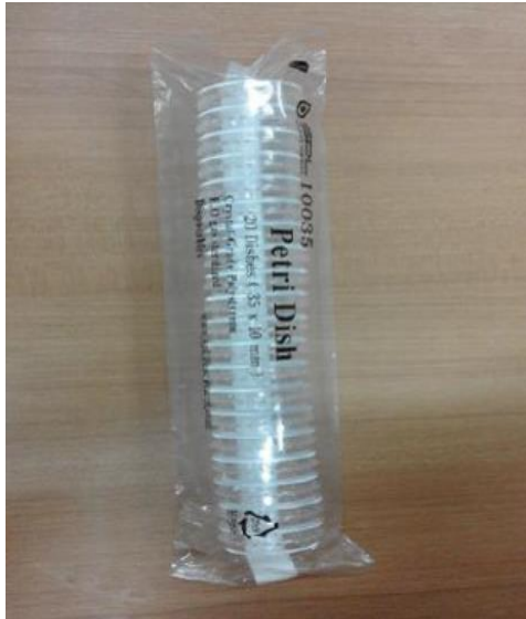
Disk Maturasi dan Fertlisasi