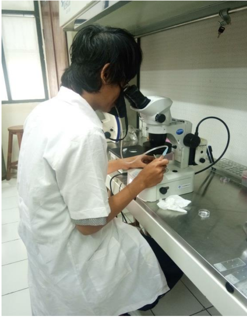
Proses Pengamatan Oosit