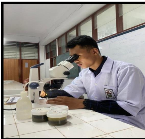
Pengamatan mikroplastik pada saluran cerna