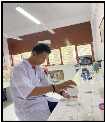
Pembuatan larutan KOH