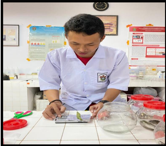
Penimbangan sampel lamun yang telah dioven