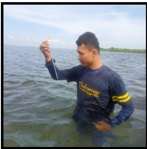
Pengamatan parameter suhu