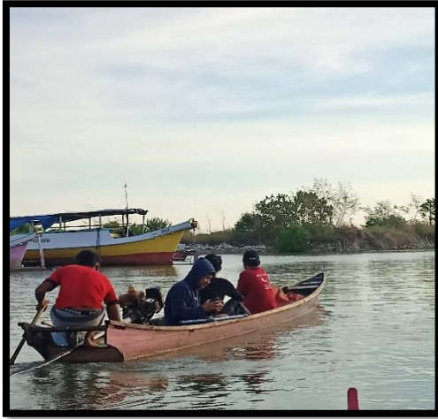
Pemberangkatan menuju titik lokasi