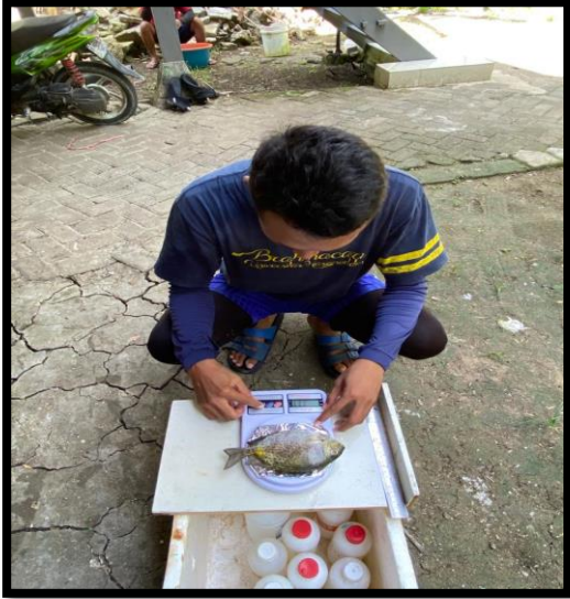
Menimbang berat ikan