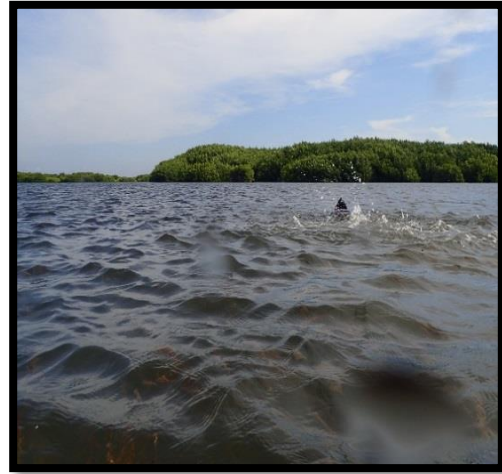
Kondisi sekitar perairan lokasi penelitian