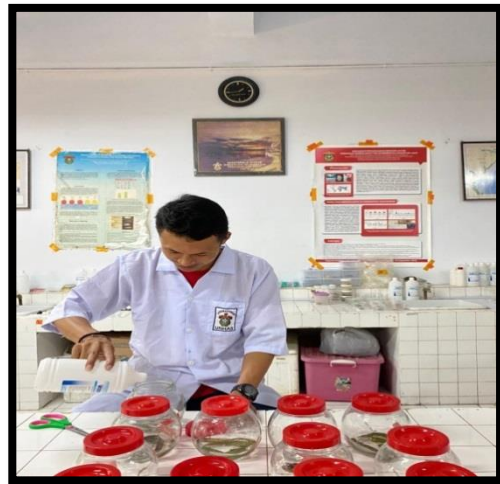
Penuangan larutan KOH pada sampel lamun