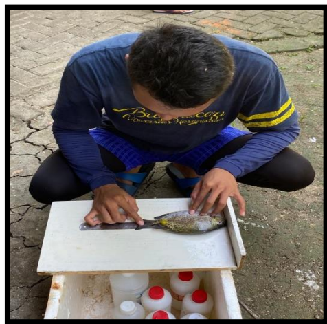
Mengukur panjang ikan