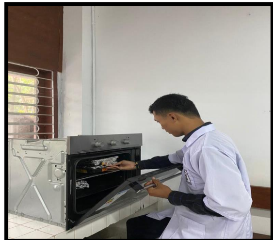
Pengovenan sampel lamun