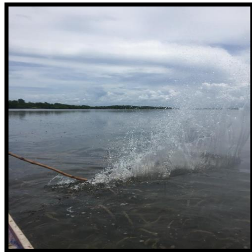
Memancing ikan masuk ke dalam jaring