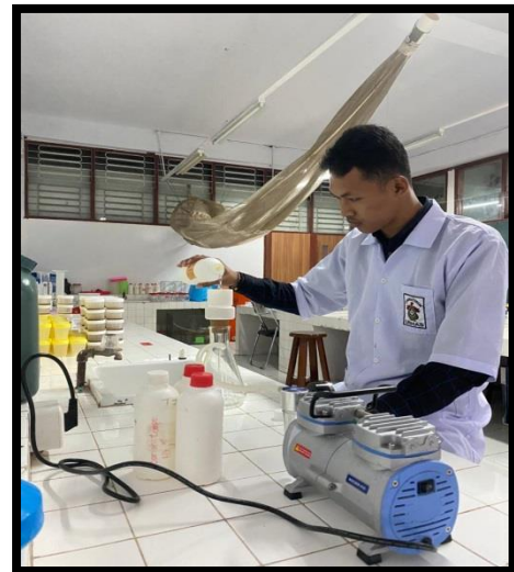
Penyaringan sampel air