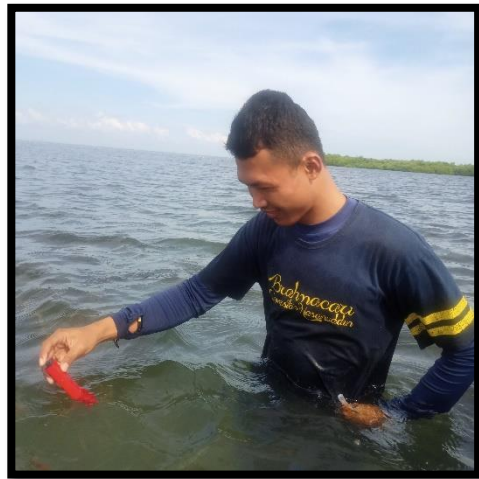
Pengamatan parameter pH