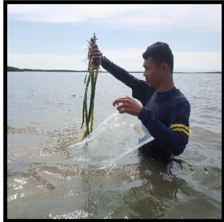
Pengambilan sampel lamun