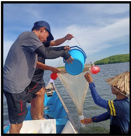
Pengambilan sampel air