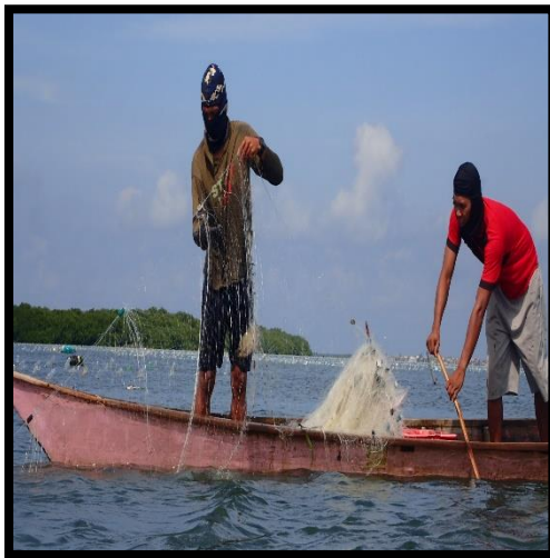
Penangkapan ikan menggunakan jaring