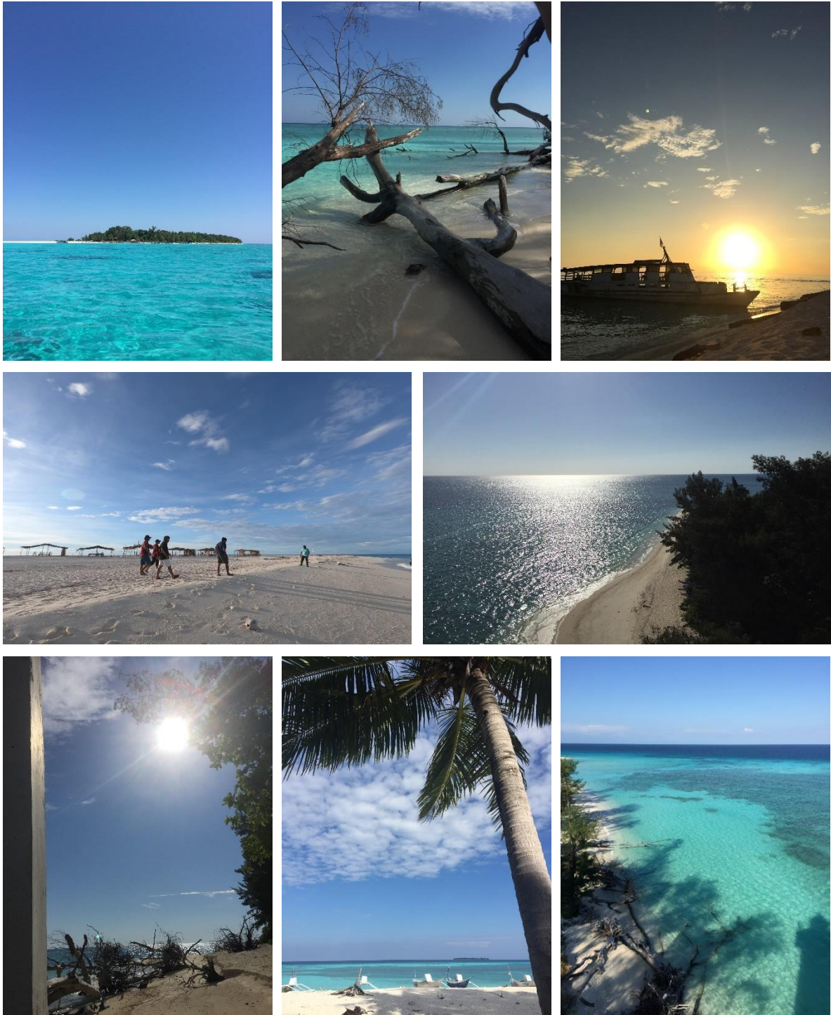
Gambar 22. Pemandangan Pulau Lanjukang.