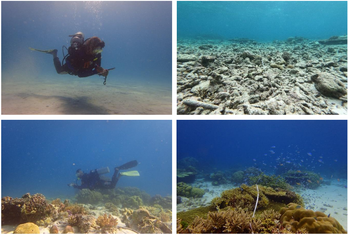
Gambar 20. Proses survey.