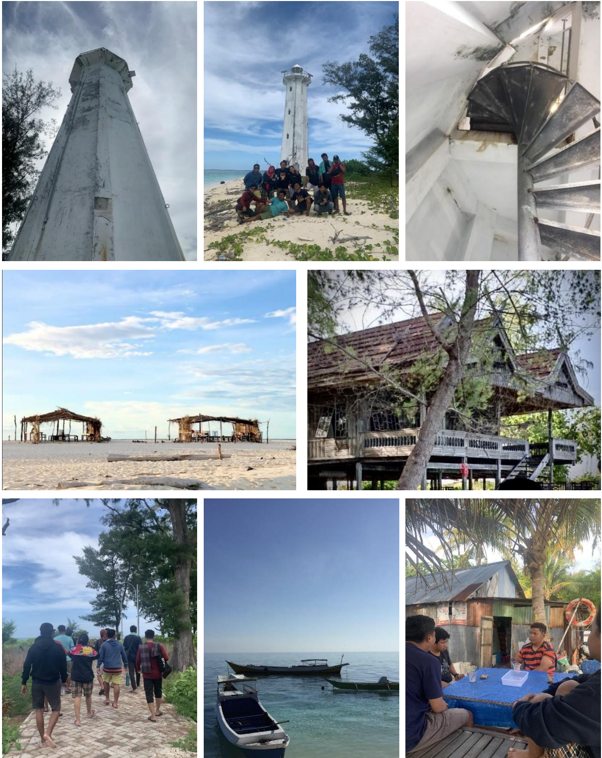
Gambar 23. Sarana dan prasarana di Pulau Lanjukang.