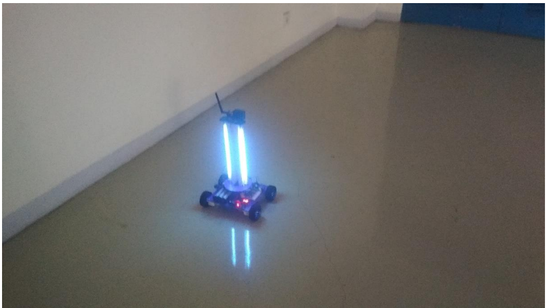
b.1. Pengujian Mobile robot