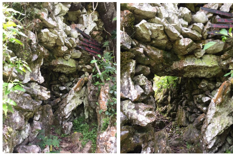
Lampiran 2. Antraksi wisata (Keindahan alam)