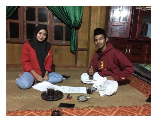
Lampiran 7. Dokumentasi Penelitian