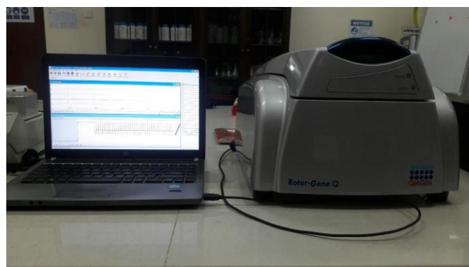
Gambar 18. Running real time PCR