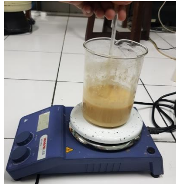
Gambar 14. Pembuatan pakan