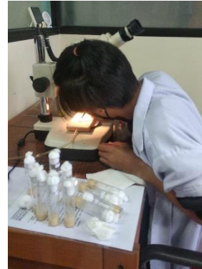
Gambar 15. Pemisahan alat jantan & bentina