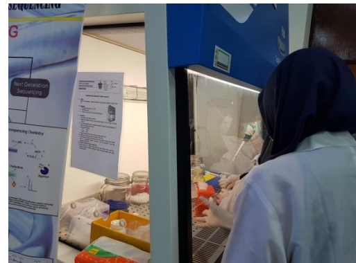
Gambar 17. Isolasi RNA