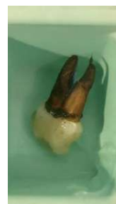
Aplikasi Karbamid Peroksida 16%