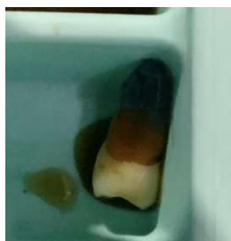
Aplikasi Gel Ekstrak Tomat 16%