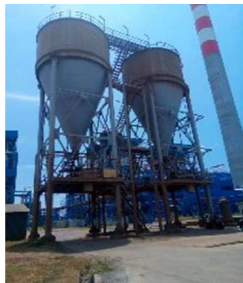
Penyimpanan Fly Ash PLTU Jenepono