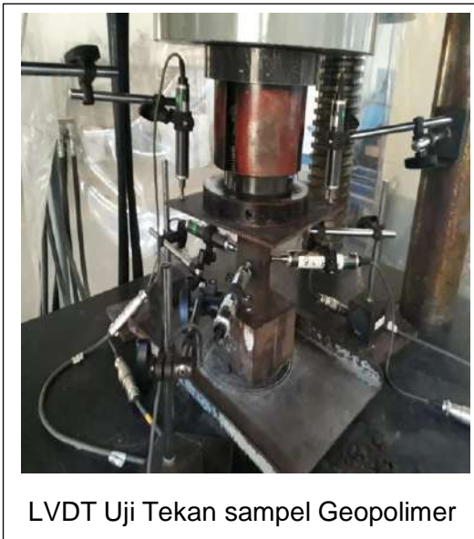
LVDT Uji Tekan sampel Geopolimer