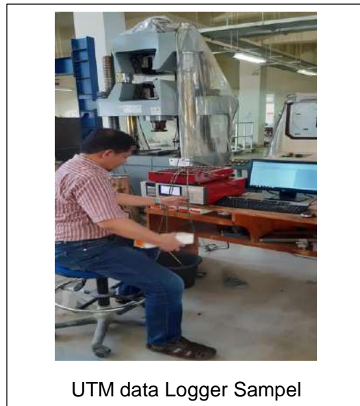
UTM data Logger Sampel