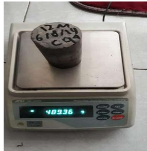
Timbangan Digital Sampel 12 molar