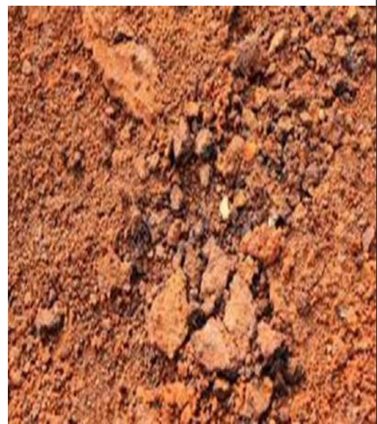
Tanah Laterit dari sekitar Kampus Gowa