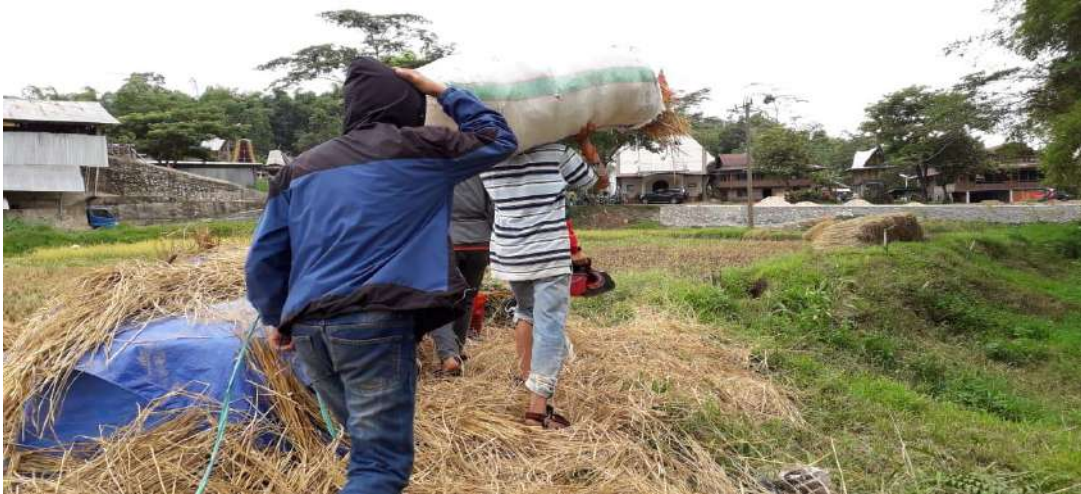
Pengambilan bahan Jerami dari persawahan di Toraja