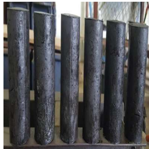
Pembuatan Sampel Geopolimer