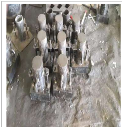
Pembuatan benda uji