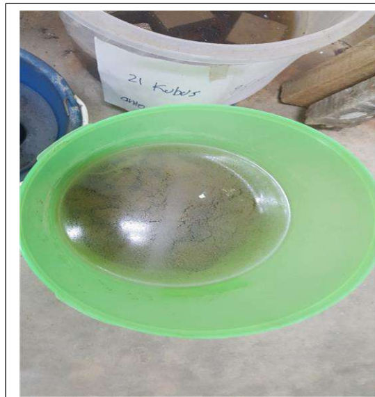
Trial Mix Sampel Curing Air