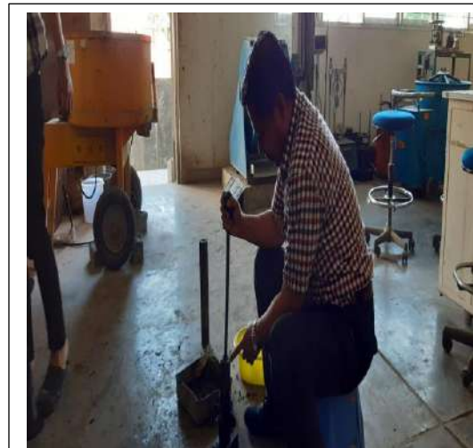
Pembuatan Sampel Geopolimer