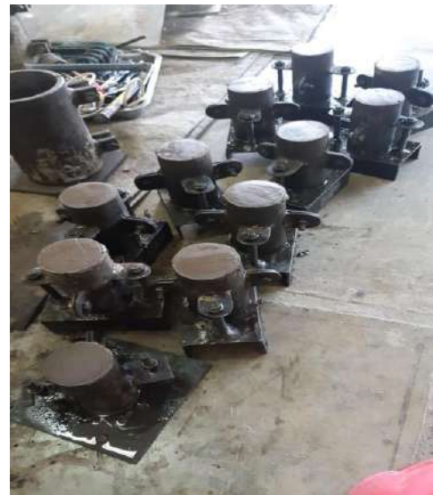
Proses pencetakan sampel