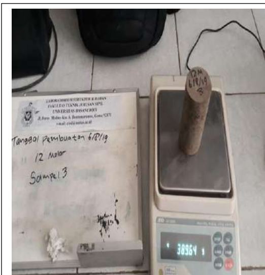
Uji Tekan Mortar Geopolimer