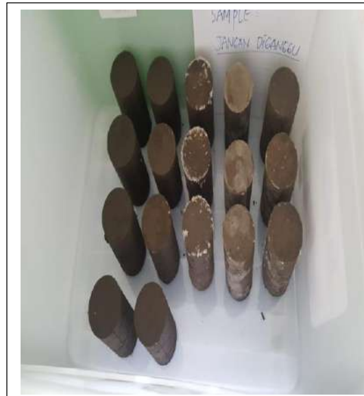
Pembuatan Sampel Geopolimer