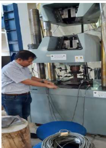
Uji Tekan Mortar Geopolimer