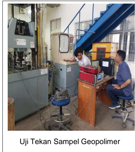
Uji Tekan Sampel Geopolimer