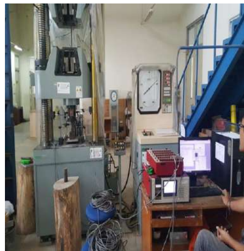
UTM, Data Loger, Komputer Set