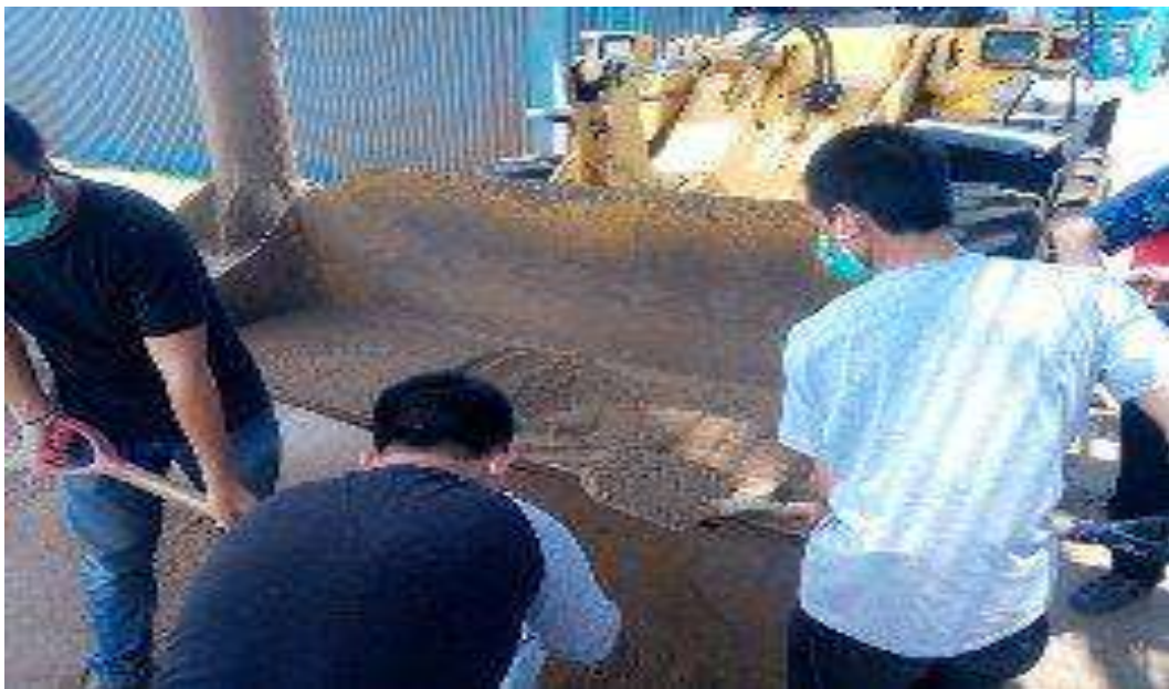
Memasukkan Limbah Fly Ash ke dalam tempat penyimpanan (karung plastik)