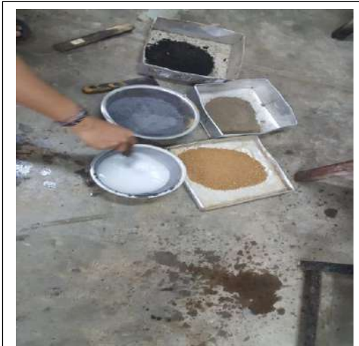
Pembuatan sampel Geopolimer