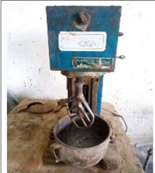
Trial mix sampel