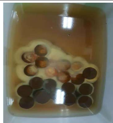
Perendaman Asam Sulfat