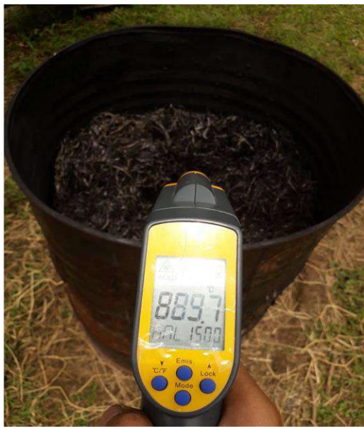
Pembakaran batang jerami padi