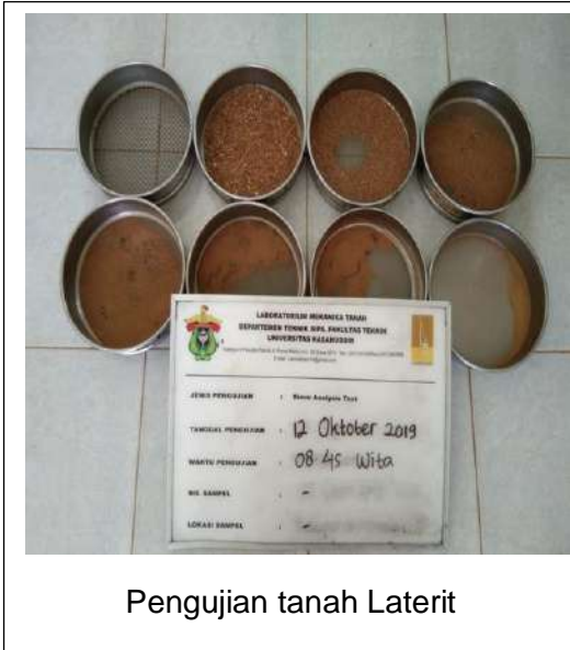
Pengujian tanah Laterit