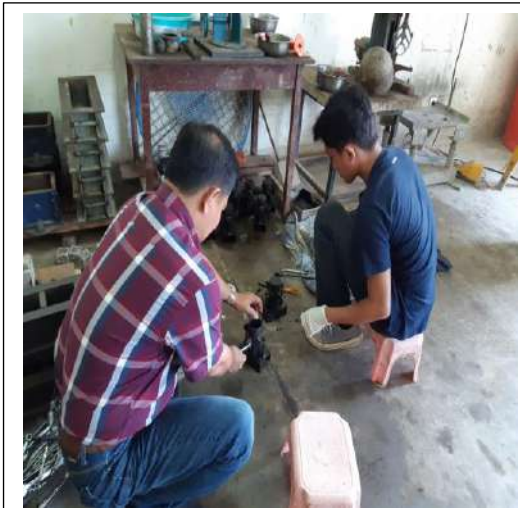
Pembuatan sampel Geopolimer