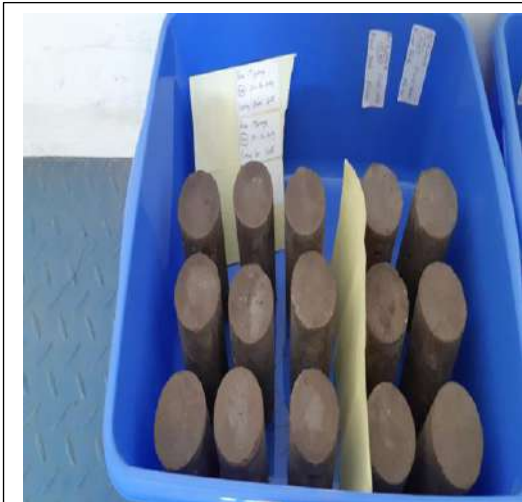
Pembuatan sampel Geopolimer