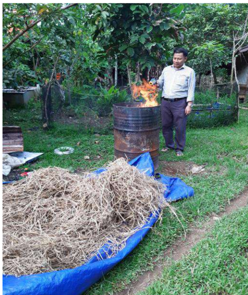
Pembakaran batang Jerami padi