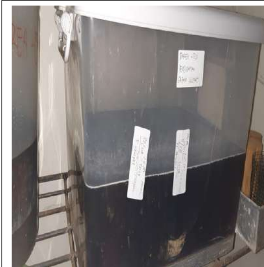
Curing Air sampel Geopolimer