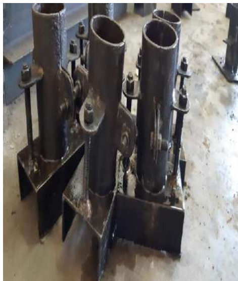
Silinder benda uji