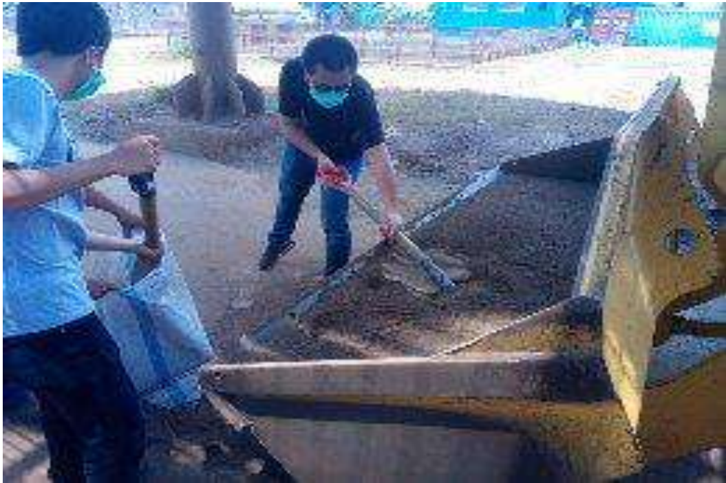
Pengambilan Limbah Fly Ash dari PLTU Jeneponto