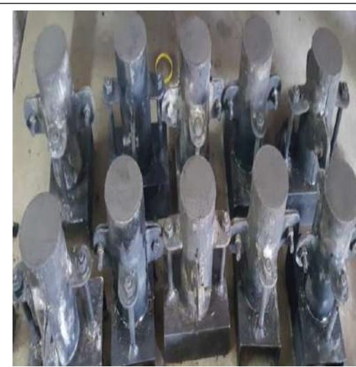
Pembuatan benda uji