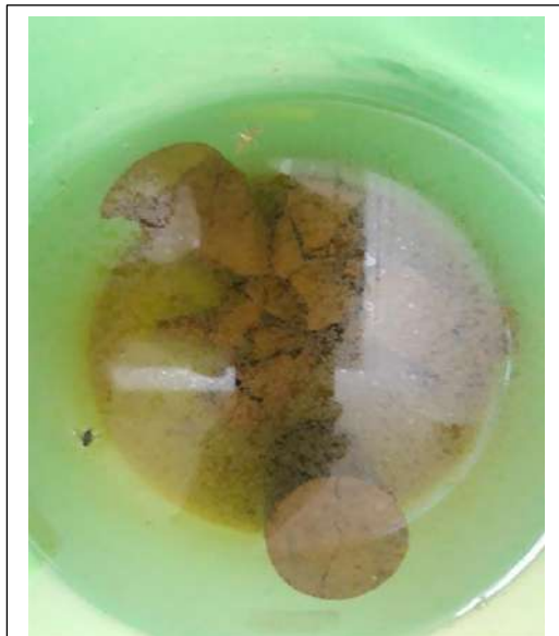
Pembuatan Trial Mix Sampel