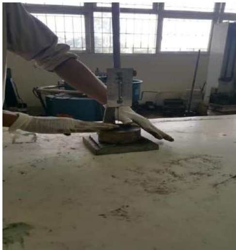
Vicat Tes Mortar Geopolimer