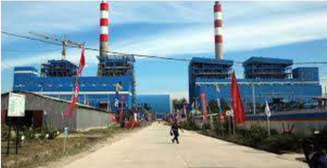
Pengambilan Fly Ash dari PLTU Jeneponto