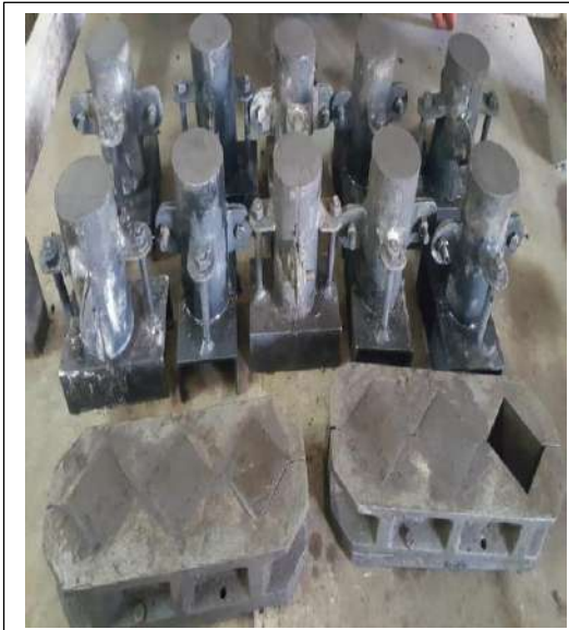
Pembuatan sampel Geopolimer