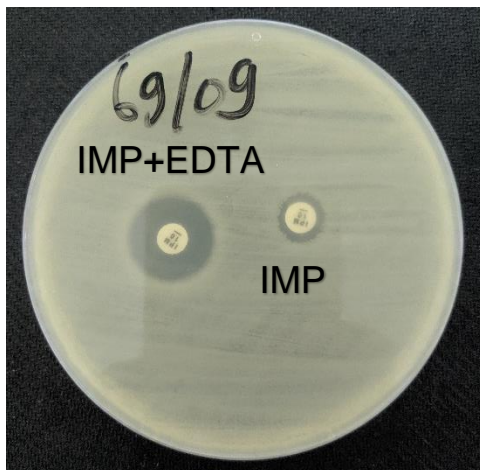
Lampiran 3. Gambar Hasil Pengamatan

Keterangan : Perbandingan zona hambat antara disk CDT IMP dengan EDTA+IMP \geq 7 mm dinyatakan sebagai hasil yang positif menghasilkan MBL (Yong, D. et al , 2002).