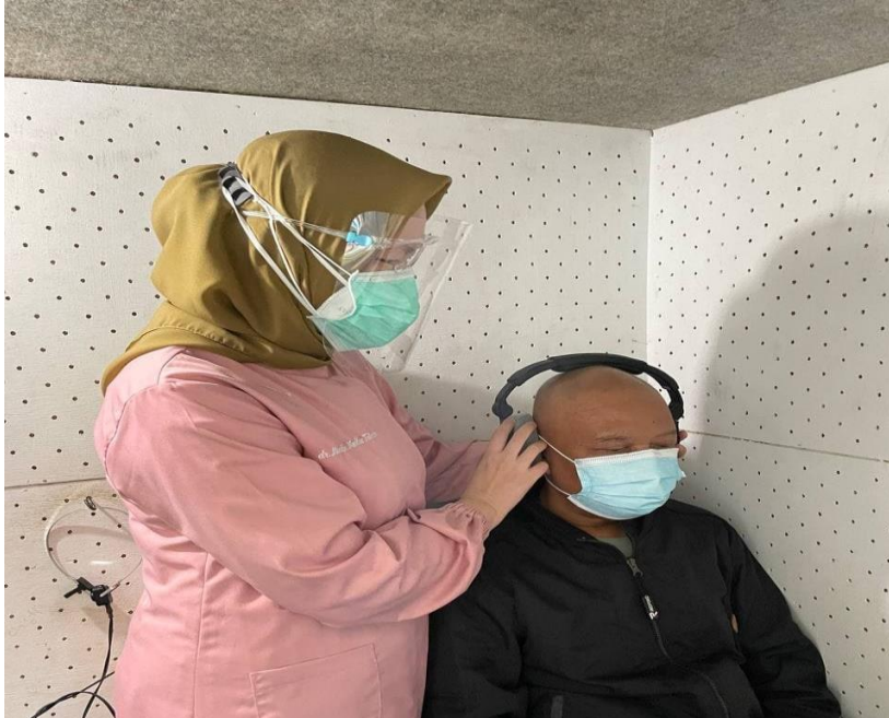
Pemeriksaan PTA (Air Conduction)