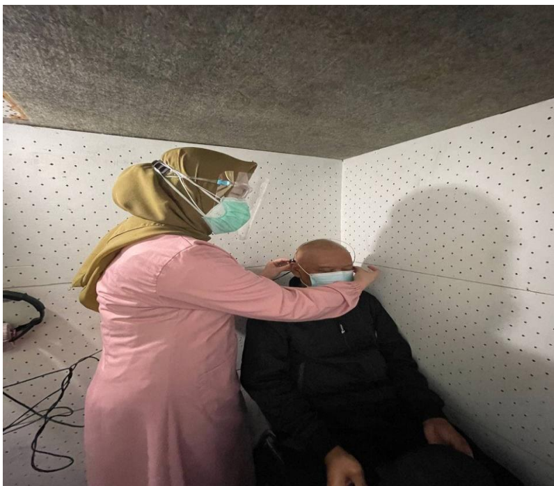
Pemeriksaan PTA (Bone Conduction)