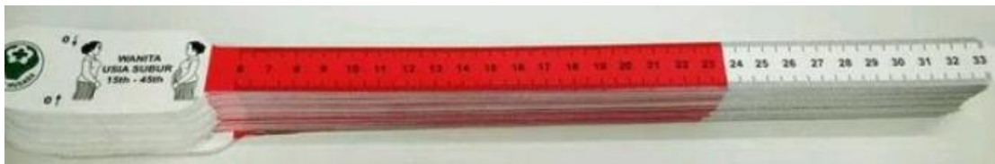
Pita Pengukuran LILA Ibu Hamil