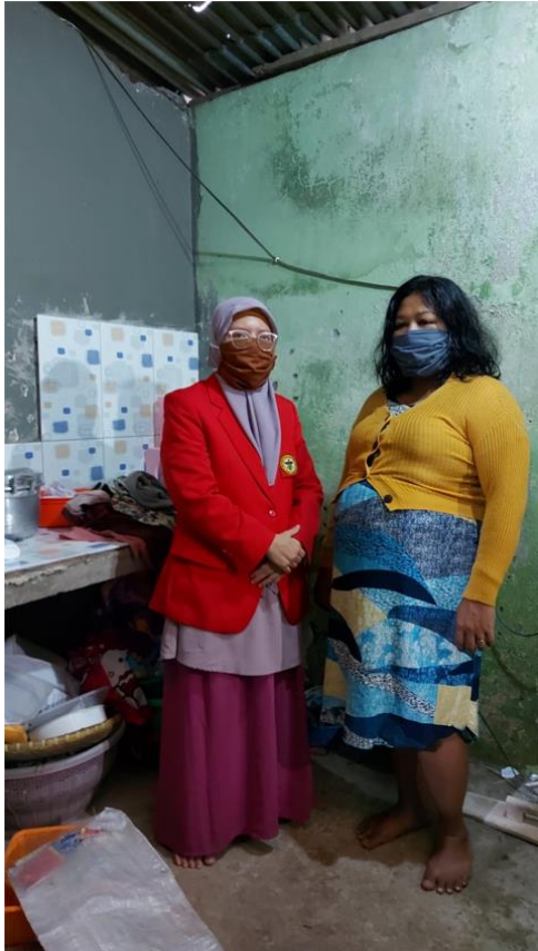
Lantai Rumah Terbuat dari Plester