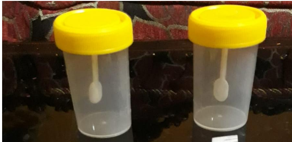
Wadah Sampel Feses Ibu Hamil