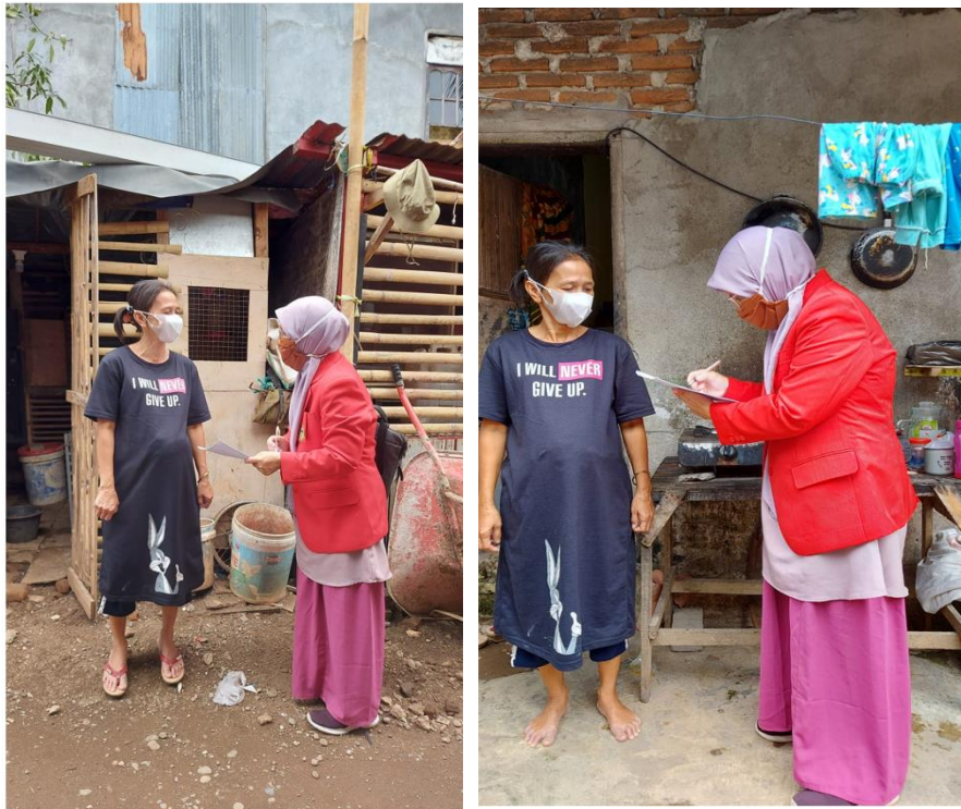
Wawancara Pengisian Lembar Observasi Peneliti dan Ibu Hamil