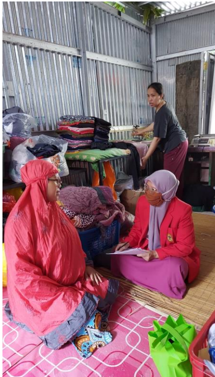
Wawancara Pengisian Lembar Observasi Peneliti dan Ibu Hamil