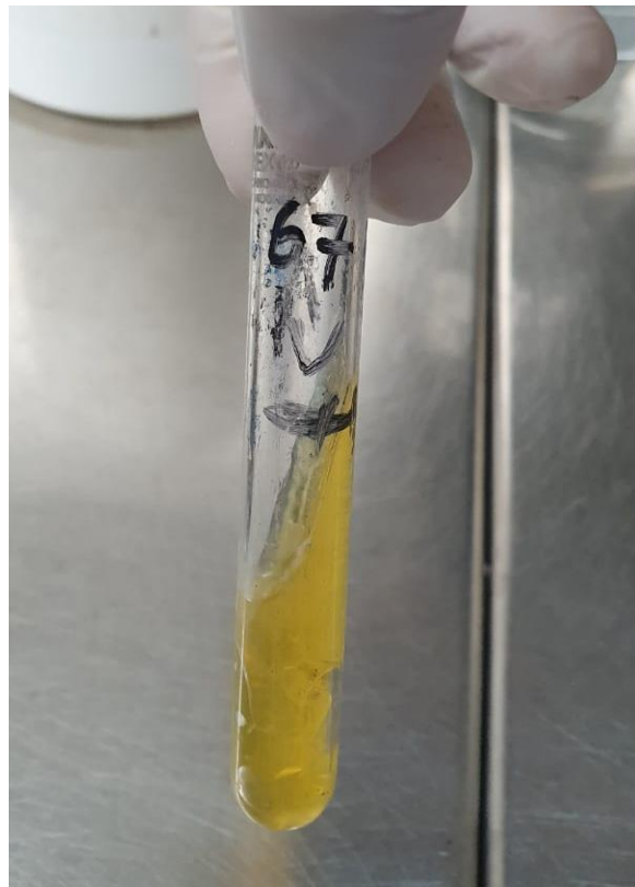
Gambar 10. Isolat Klebsiella Pneumoniae pada medium TSIA