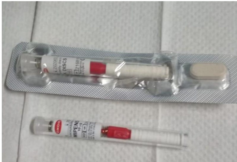
Gambar 11. Paper Disc Antibiotika (Imipenem 10µg)