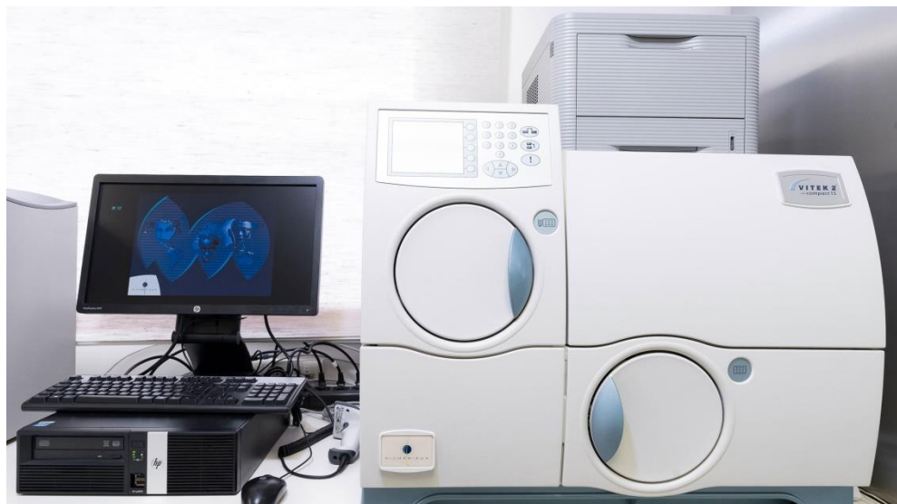
Gambar 8. Alat Vitec 2 Compact

Yong D, Lee K, Yum JH, Shin HB, Rossolini GM, Chong Y. Metode cakram Imipenem-EDTA untuk diferensiasi isolat klinis Pseudomonas spp. dan Acinetobacter spp. J Clin Microbiol. 2002; 40: 3798–801