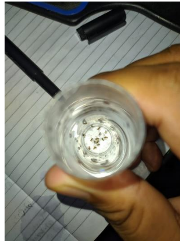
Gambar 12. Perhitungan Lalat Baru