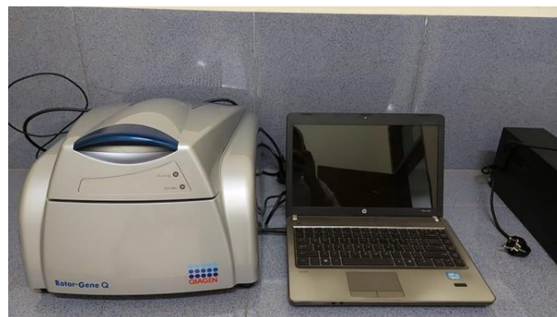
Gambar 14. Alat Thermal Cycler