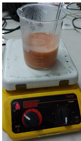
Gambar 17. Proses Pembuatan Pakan Lalat