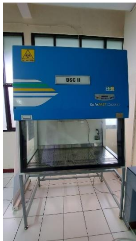
Gambar 15. Meja Kerja BSC