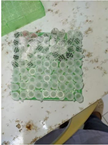
Gambar 11. Sampel Hasil Isolasi RNA