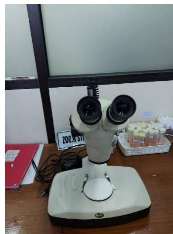
Gambar 16. Alat Mikroskop