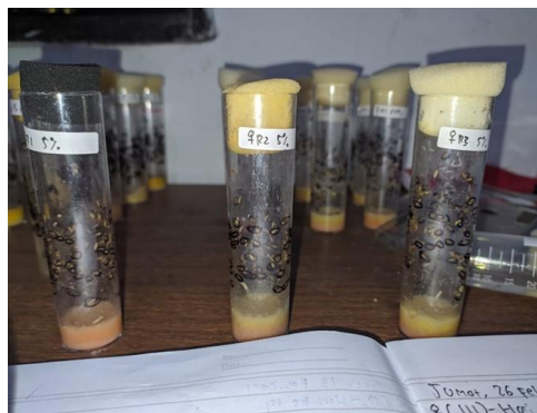
Gambar 13. Pengamatan Uji Reproduksi