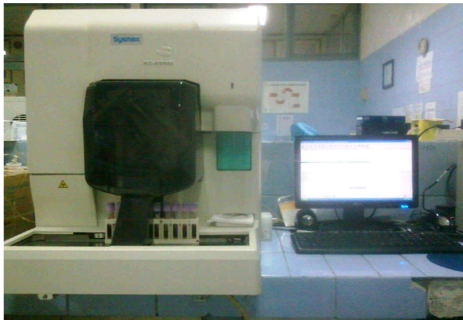
Gambar 7. Alat Penelitian