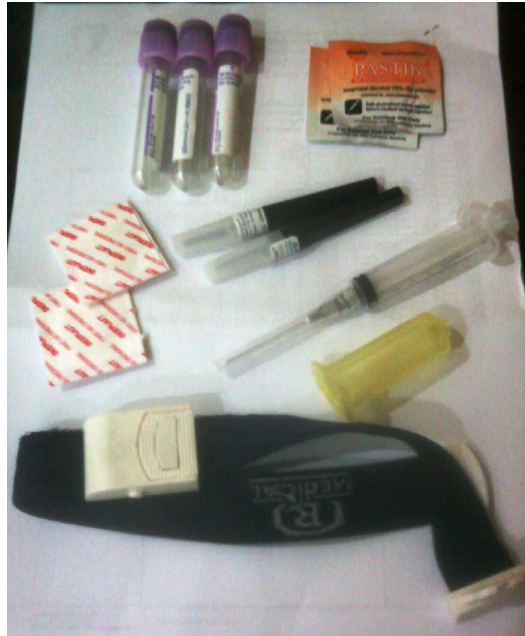
Gambar 6. Bahan penelitian