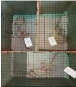
Perawatan tikus pasca operasi