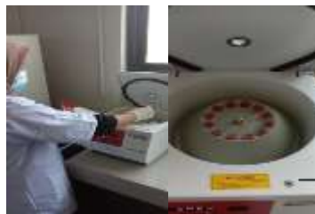
Sentrifuge 5-10 Menit