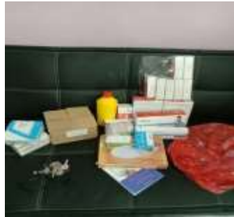
Persiapan alat dan bahan operasi