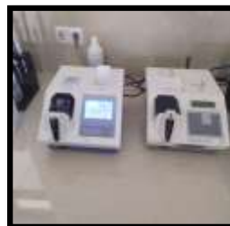
Proses pengujian kadar calcium darah