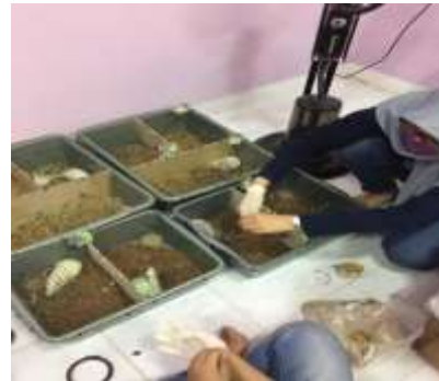
Pemberian pakan dan minum