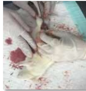
Pengambilan sampel femur