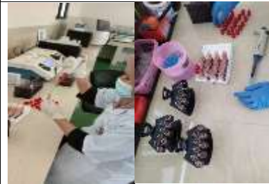
Persiapan serum darah