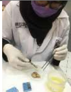
Perendaman tulang di cairan HCL