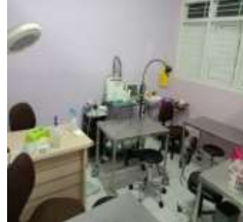
Persiapan Ruang Operasi