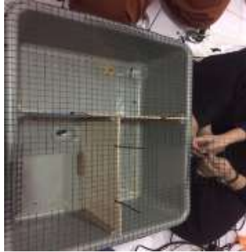
Persiapan kandang tikus