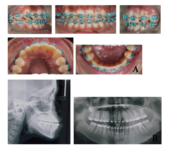
Figure 5 A. Intra oral photographs after orthogtnatic surgery, B. Cephalometric and panoramic photograph after orthogtnatic surgery

Cooperation between orthodontists and oral surgeons is needed in treating this type of patient. Good cooperation needs to be established from the beginning, starting from the determination of diagnosis and treatment plan should be established together. In this case, a joint diagnosis and treatment plan was determined. Specifically for orthognathic surgery plans, the final occlusion condition, wafer design, type of surgery, whether single or double jaw, early surgery or late surgery and how much lower jaw will be reduced. 5.6.8