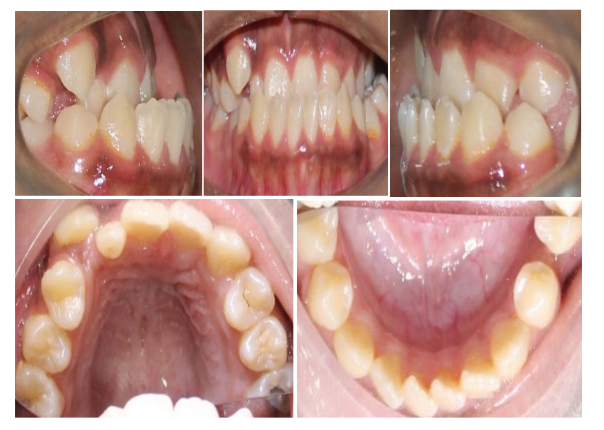
Figure 2 Intra oral photographs before treatment