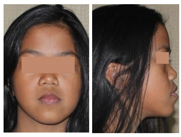
Figure 1 Profile photo before treatment