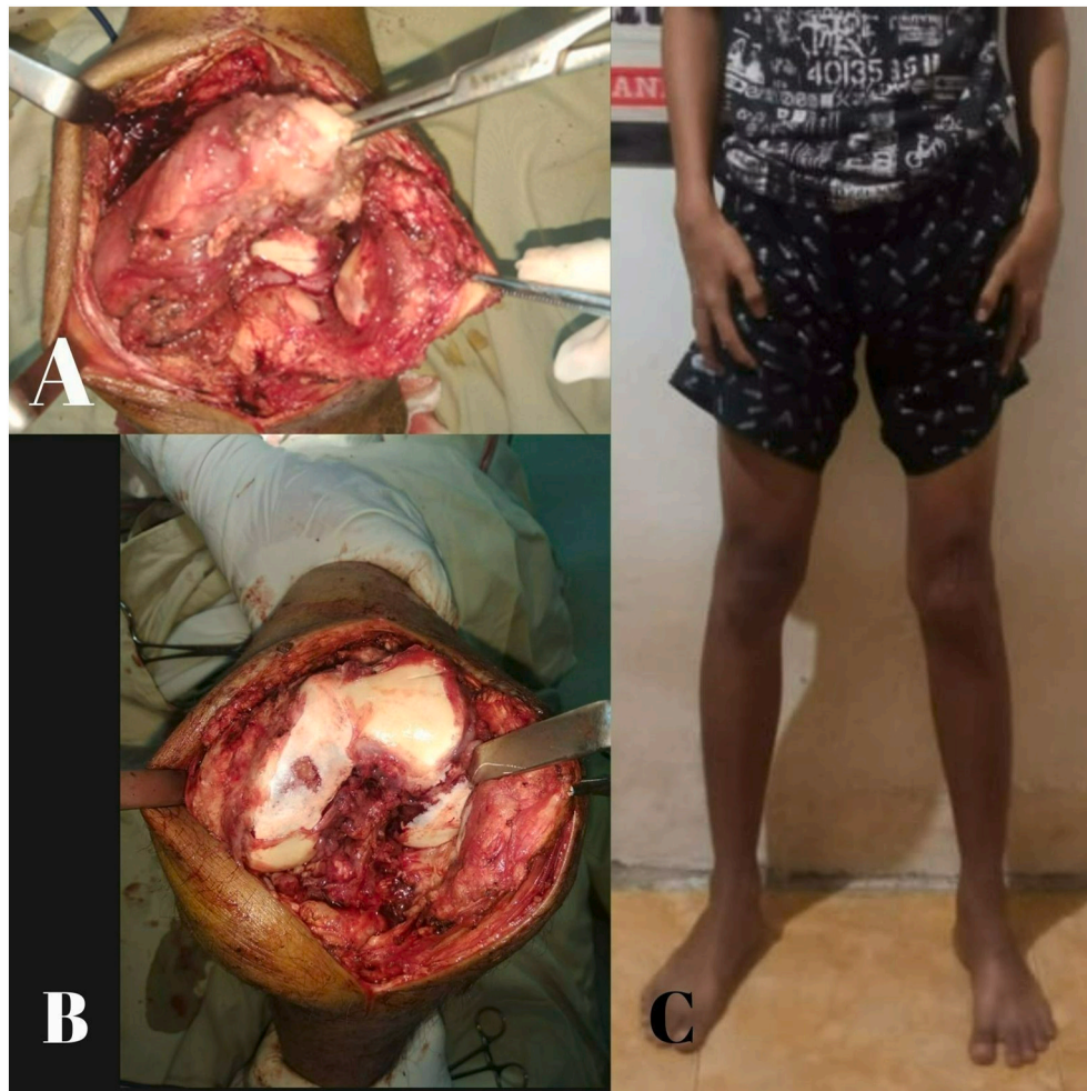
Fig. 3. Intraoperative gross appearance of the lesion in the knee joint (A); femoral cartilage appearance intraoperatively after synovectomy (B); clinical follow-up at 24 months after surgery (C).

complications of the disease process. The main indications for surgery are unresponsiveness after 4 to 5 months of the anti-tuberculous drug, severe joint destruction, joint deformity, large abscesses, neurological compromise, and painful joint ankylosis. The range of surgical procedures that could be carried out includes drainage of abscesses, synovectomy, excisional arthroplasty, arthrodesis for the joint, and joint replacement if the TB has remained inactive for at least ten years [6]. The second patient underwent surgery because the pathology report showed a tuberculous infection with clinical manifestation of the late stage of TB arthritis characterized by large painful mass, swelling, and stiffness in his left knee. Intraoperatively we found fibrosis of the knee joint capsule and destruction of the femoral cartilage. Surgical intervention was preferred to detect related pathology and achieve better functional outcomes, resulting in less pain and increasing range of motion of the knee joint.