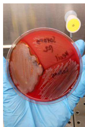
Kultur pada media Blood Agar