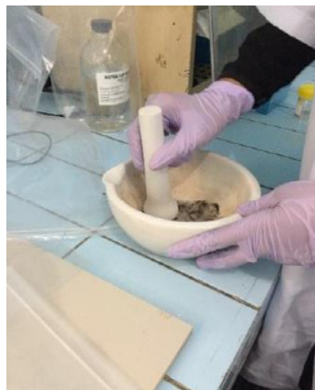
Penggerusan sampel sarang burung walet