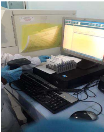
Memasukkan data ke vitek 2 compact