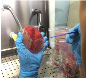
Pengambilan koloni pada media