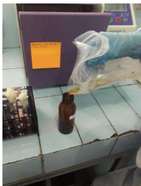
Sampel yang telah dituangkan media BHIB