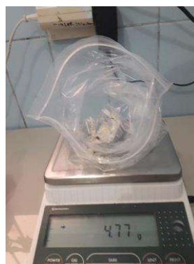
Penimbangan sampel sarang burung walet