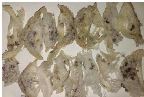
15 Sampel Sarang Burung Walet