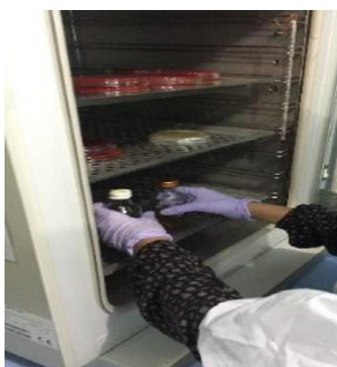
Sampel dimasukkan ke dalam inkubator