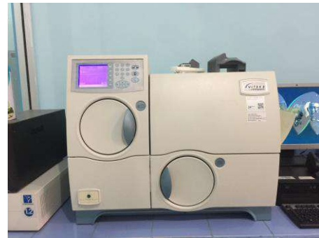
Memasukkan kartu vitek ke mesin vitek 2 compact