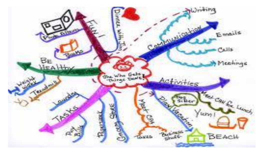
Figure 1. The example of mind mapping, Herdian (2009)

Herdian (2009: no page) stated that mind map is a way putting the information in the brain and taking again in out of the brain. The mind map form is like the maps of city having many branches. Moreover, he argued that mind map can be called as route map to order ideas and facts, so the brain can easily remember.