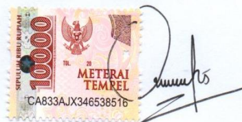
Nur Istiroqah Sanjaya