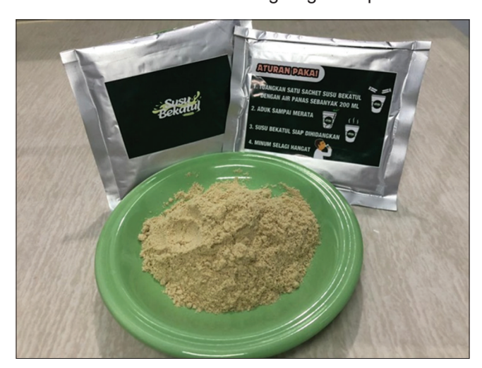
Figure 1: Samples of rice bran milk

one panelist in an organoleptic testing booth. Panelists were given an explanation of the assessment forms and other important matters when conducting organoleptic tests. Panelists were asked to write a hedonic scale response on the form provided by ticking the box according to the feeling he felt/assessed. In taste testing, panelists are sure to always drink water before moving from one formula to another in giving an impression.