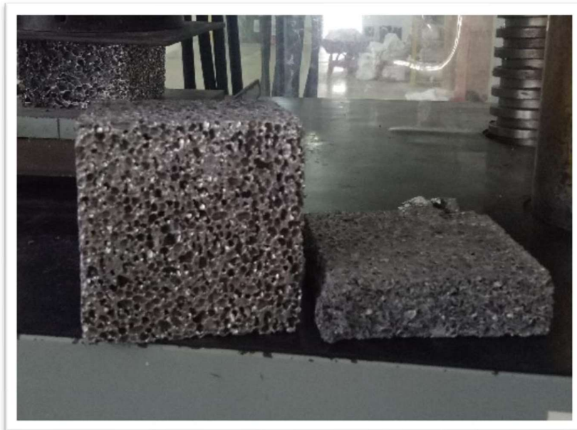
Gambar 4.22 Spesimen hasil uji tekan