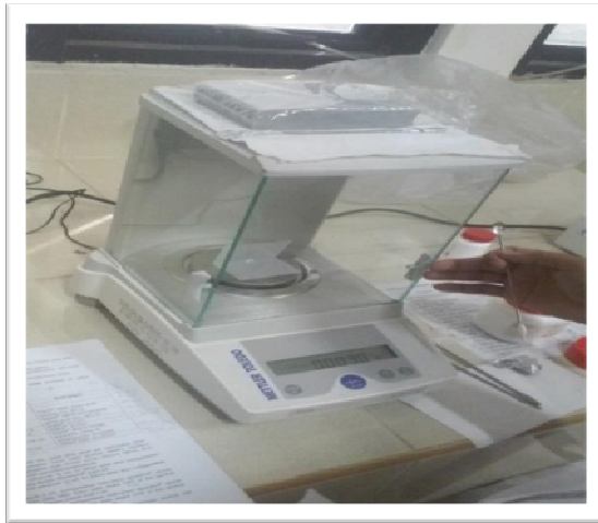
Proses Pembuatan Media Kultur