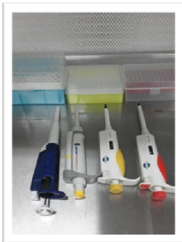
Mikropipet dan Tip