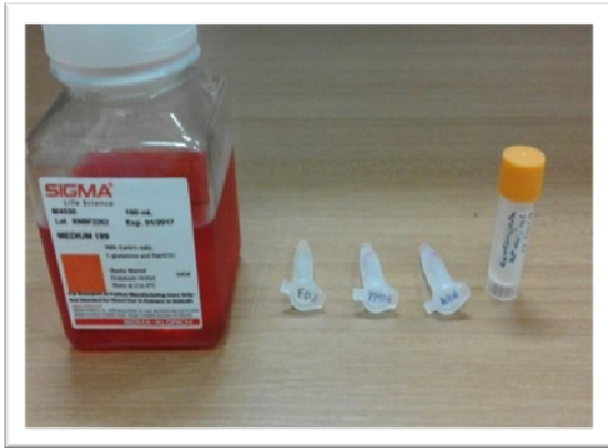
Bahan Media Maturasi