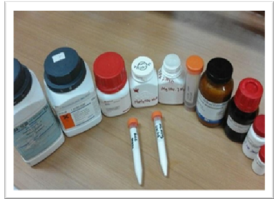
Bahan Media Fertilisasi