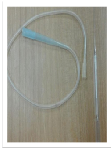
Pipet dan Selang