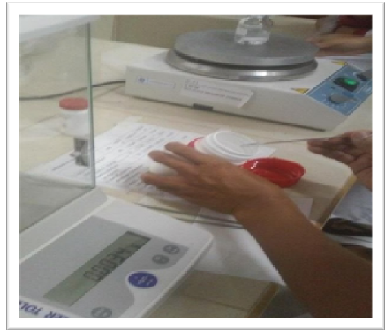
Pembuatan Media Kultur