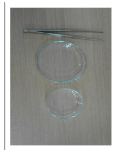
Cawan dan Pinset