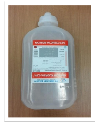
Larutan NaCl 0.9%